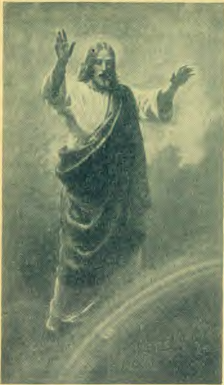
At His ascension Jesus promised that He would surely return.