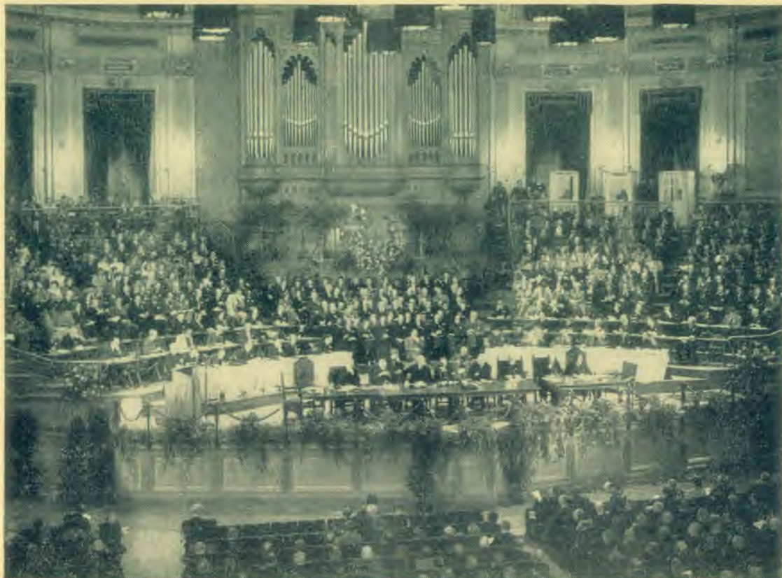
When the World Council meets for its second session in 1954 one of the most important themes will be the second coming of Jesus.