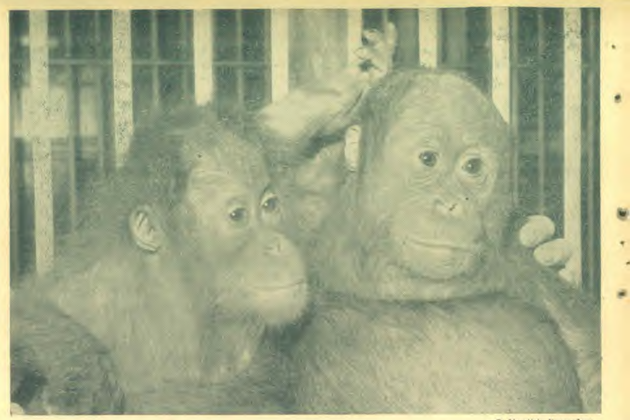
It matters a great deal whether man has ascended from the ape or is a direct creation of God.