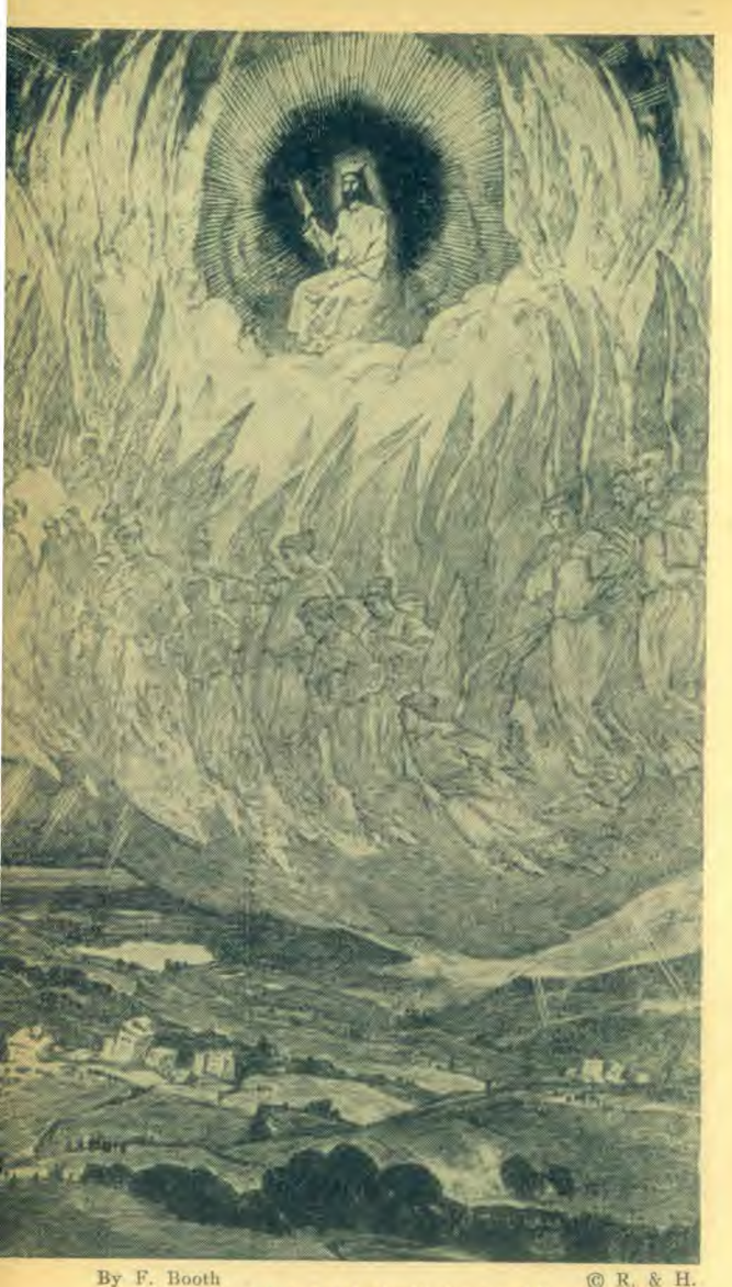
"The Lord shall descend."

★ THEY expected a king—He was bound as a criminal. He would free them from Roman rule, they thought—Roman chains held Him; a Roman lash tore His flesh; a Roman cross was laid upon His shoulders.