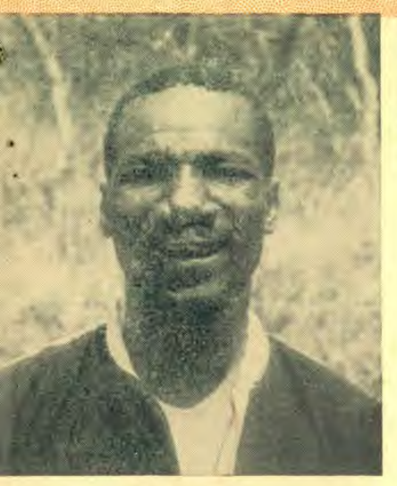
d. AFTER . treatment for leprosy.

eat." There is no more painful ordeal for them to go through now.