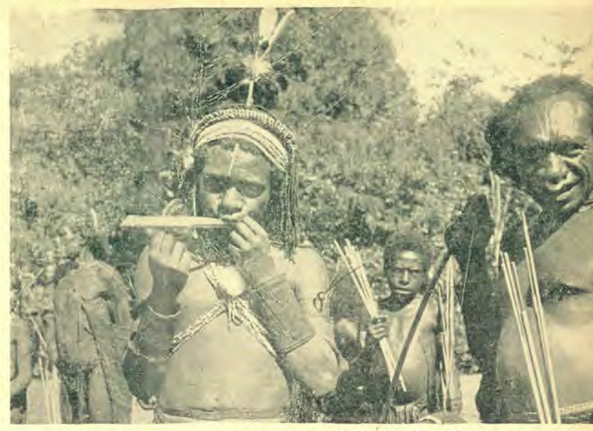
Natives of the interior of New Guinea.

During the second World War, our converted natives, and those of other missions, did a marvellous work for the allied forces operating against the Japanese invaders, acting as guides, carriers,