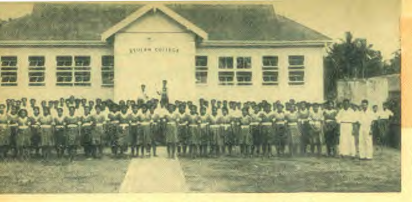
Beulah Training School, Tonga Islands.