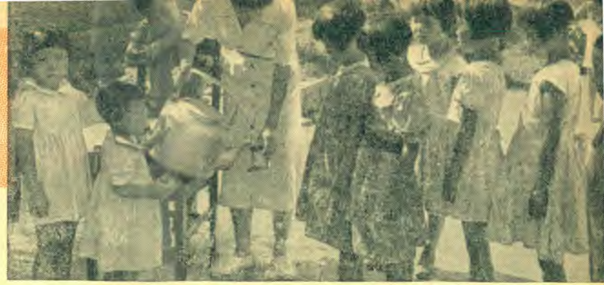
Victims of the Korean War find timely help at the Mission's orphanage, Secul.

The medical mission launch "Luzeiro" on the Amazon.