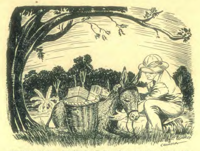
The donkey lay down, breathing heavily for a minute, and then closed his eyes.

It took only a few minutes to load the donkeys, and then he stood ready to start his journey. The Chinese guide appeared, and they were on their way.