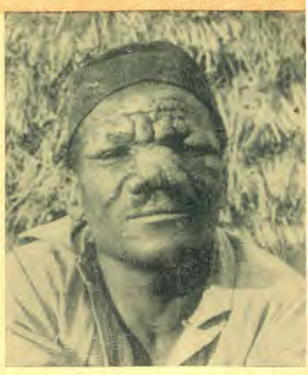
BEFORE The result of one year

This is the cry of every leper in the leper colonies in Africa. The old method of treating leprosy by injection was most painful. It took much longer to arrest this dreadful disease.