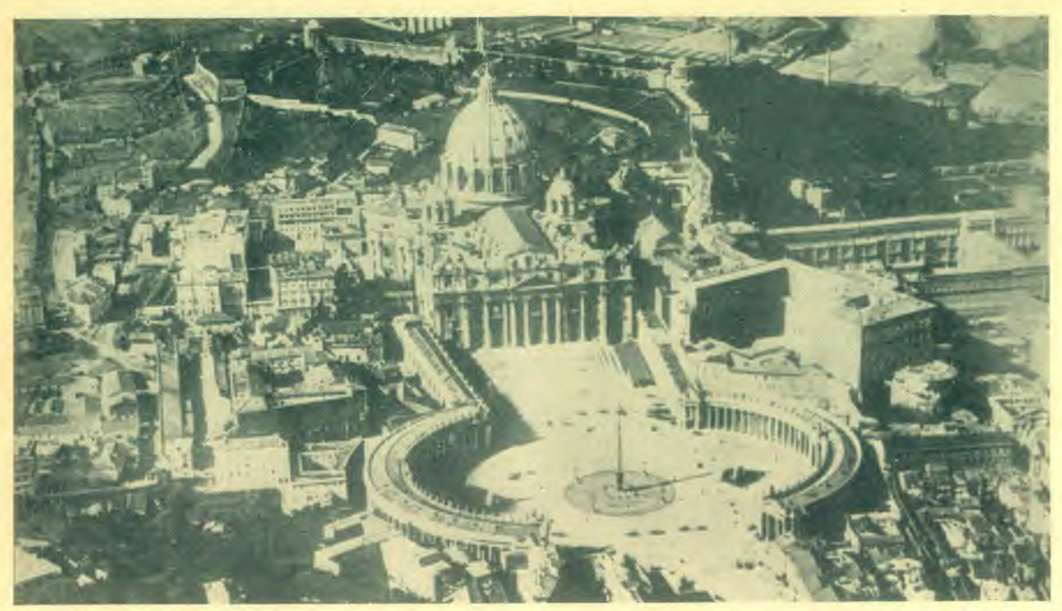
Aerial view of the Vatican City, with St. Peter's Basilica in the centre,