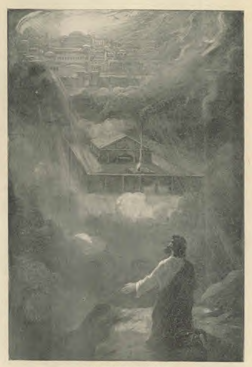
THE THREE TEMPLES

This illustration is taken from the new edition of the "Story of Daniel the Prophet."