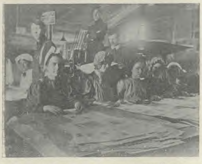
STUDENTS GILDING "BIBLE TRAINING SCHOOL" COVERS.

sold 45,000 special BIBLE TRAINING SCHOOLS mostly in the cities of the Southern states, and from the sale of these papers have furnished over $600 for the Loma Linda college and about $500 for the mission work in