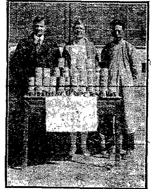
Investment Offering, Yencheng, Honan.

on Sabbath; proceeds from vegetable garden; money earned by being patient for hydrotherapy class. (We have some ten—or twelve-year-old boys come in for the boy nurses to practice on in their hydrotherapy class, and I give these boys a few coppers each time). One Chinese woman went without a hat this winter, and put the price ($1.00) in her Investment can.