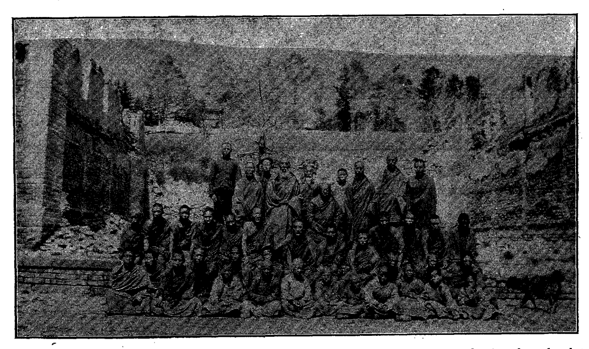
Lamas of ....., who asked to hear the Gospel message, and who offer to us the site where the photo was taken, as a place on which we may erect a chapel with materials the Tibetans volunteer to prepare free of charge.

"May 31. Pictures of the Abbot, and of the whole group, were taken, and then we started for Choni. We passed through fertile valleys, with forest-covered mountains always in sight, and finally come to the ruins of what was formerly the Prince's headquarters. Mohammedan bandits have about finished it, and no one lives there. We were informed that the Prince had moved across the river, to a location that could be successfully defended against any attack. So we crossed the Tao River, a beautiful mountain stream that is crystal clear, rushing through an Alpine valley