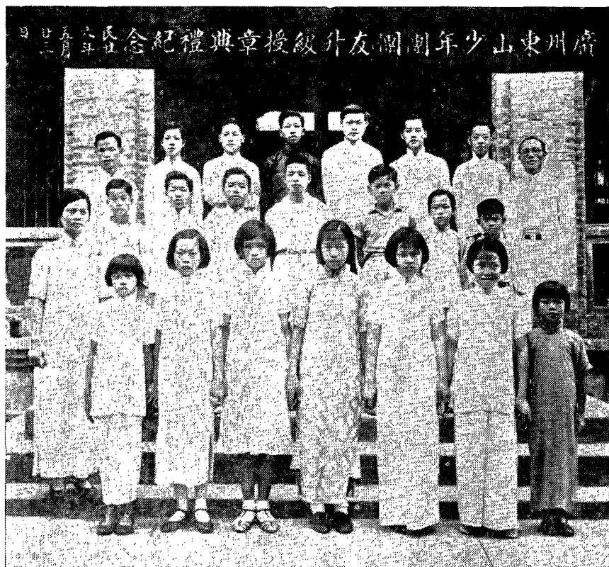
Group Receiving "Friends" Insignia, South China Training Institute

We take pleasure in presenting this group of Tungshan "Friends" to our friends all over China, and in passing may we invite many more of you to hurry up and finish your requirements so that you, too, may become members of our ever-increasing "Friends" group of Missionary Volunteers.