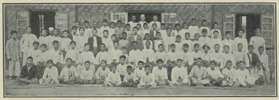
MEIKTILA INDUSTRIAL SCHOOL, BURMA. PRI

Much attention has been paid to the leather work, perhaps because it pays best. It alone of the trades is self-supporting. The shop is equipped with sewing, punching, eyeleting, and hook machines. Because a Burman's chief delight is to turn a lever and let a machine do the work, and because he can-