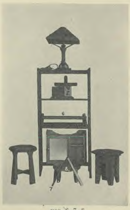
Nos. 6, 7, 8

and tract rack No. 4, with a diamond-shaped mirror in front, requires some skill to finish properly. Lumber for this should be three-eighths inch thick. Bottom must be checked into sides. Nearly a thousand tracts can be kept in rack No. 1, designed especially for church use. It has twenty-five separate compartments, nine for Bible Students' Library and sixteen for Apples of Gold Library. It is very neat, and will stand on the table or shelf, or hang on the wall. One after