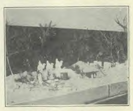
A Christmas Story

This little Swiss sand table scene can be used to illustrate a geography lesson on Switzerland. In the background are the Swiss mountains covered with snow, to represent which, flour was used. At one side of the mountains is a small Swiss hospital, and in front a little to the other side is a chalet. In front of the mountains are a few little Swiss children with their pet animals. To the left is the small corner of a lake, on which is a sailboat. FLORENCE BYLSMA.