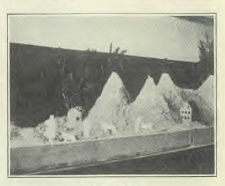
A Swiss Scene

opening at the top of the trunk. The camp scene at the side was made of an oblong piece of chamois skin and camels taken from other patterns. The ostrich was also traced from a pattern, and the eggs in its nest were carved from bits of chalk. The pyramids at the foot of the hills in the background were made of gray paper. LOUISE DEDEKER.