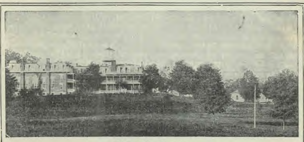
"Beautiful for Situation"