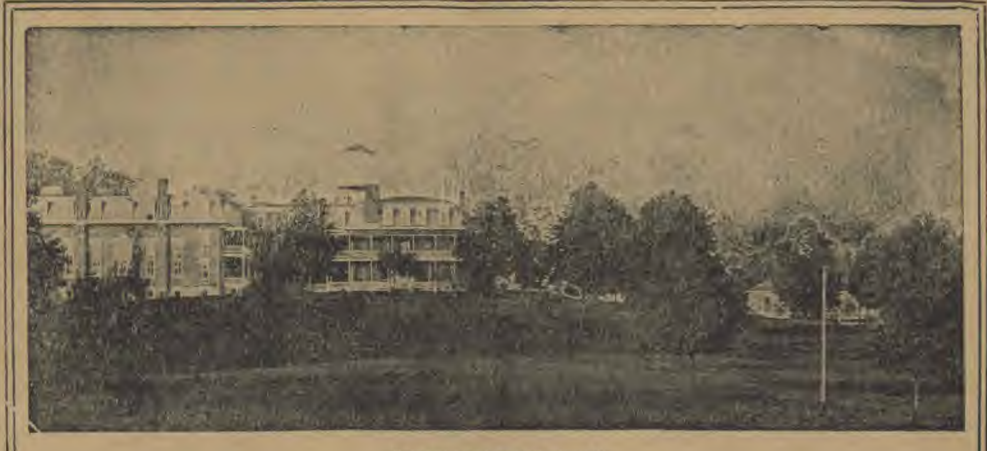
"Beautiful for Situation"