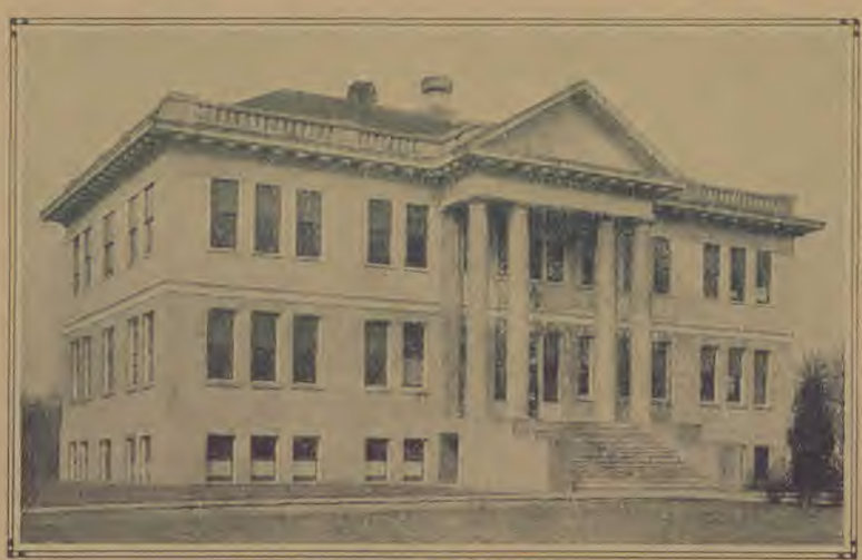
"The Gateway to Service "