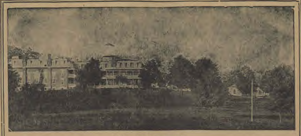
"Beautiful for Situation"