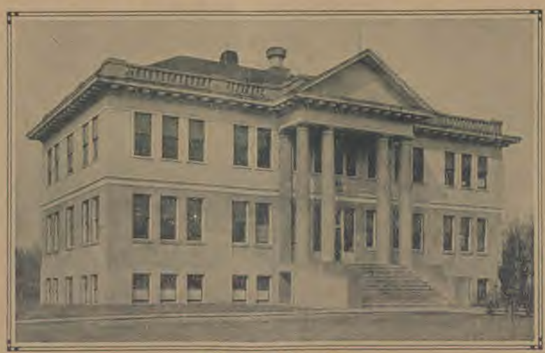
"The Gateway to Service "