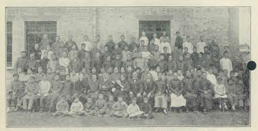
CHINA MISSIONS TRAINING SCHOOL, FACULTY AND STUDENTS, 1918-'19