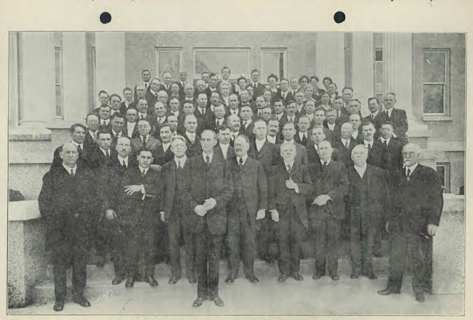
DELEGATES TO EDUCATIONAL COUNCIL, WASHINGTON, D. C., APRIL, 1919