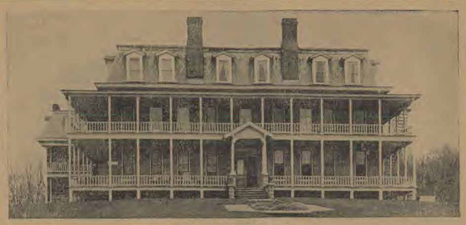
"Beautiful for Situation"