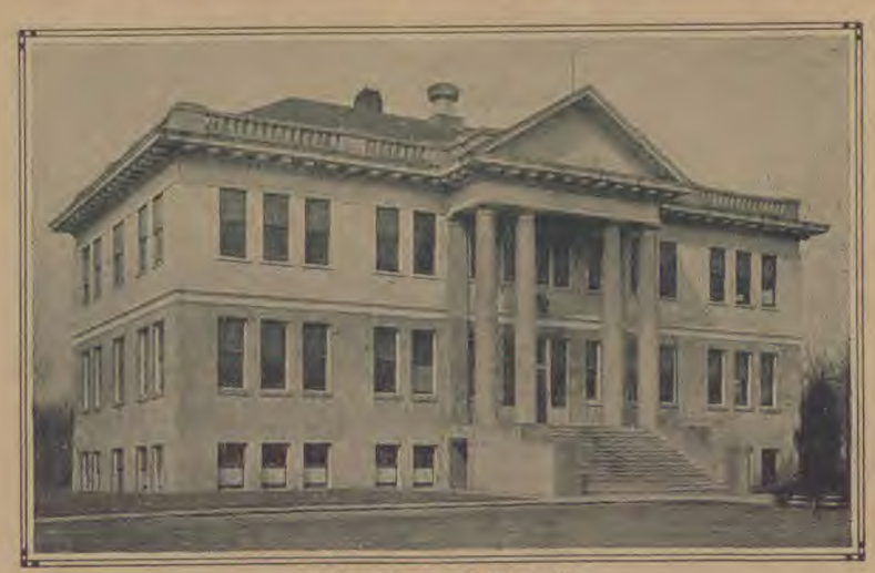
"The Gateway to Service"