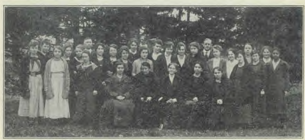
NORMAL STUDENTS AND FACULTY, EMMANUEL MISSIONARY COLLEGE

"In the grammar class. You see we are anxious that our boys and girls learn to appreciate the need of correct and forceful English. They love to debate, but they have discovered that to debate well they must have ideas. In this instance their physiology receives the benefit. Secondly, they must know how to ex-