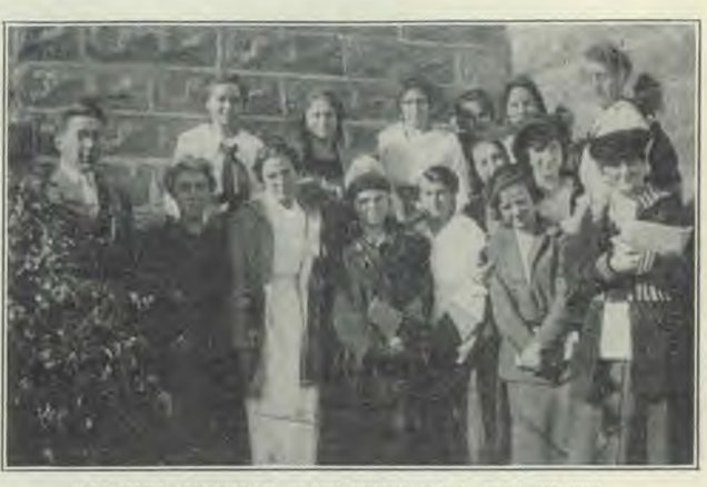
BETHEL NORMAL STUDENTS AND TEACHERS

"From the normal work I have learned that the teaching of children is not a humble work but a great work, that it is 'the nicest work' ever given to man. I have learned what true education is