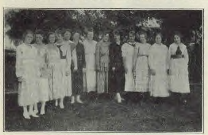
LODI NORMAL STUDENTS

Perhaps many teachers have been perplexed over finding a practical way to use the sentence and phonetic builders prepared for the first grade. As any one who has investigated knows, the builders contain an unorganized mass of words, phrases, and phonetic elements—splendid material, but very difficult to handle unless organized or graded in some way. To get the benefit of this material, a set of graded sentences based