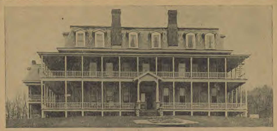
"Beautiful for Situation'