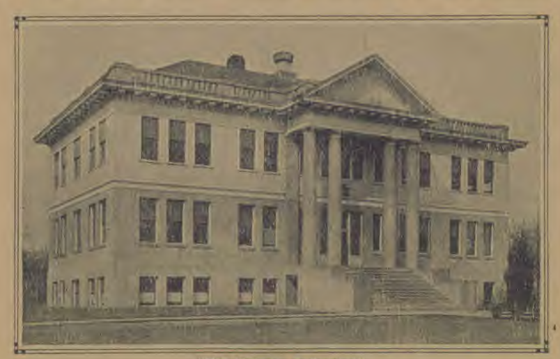
"The Gateway to Service"