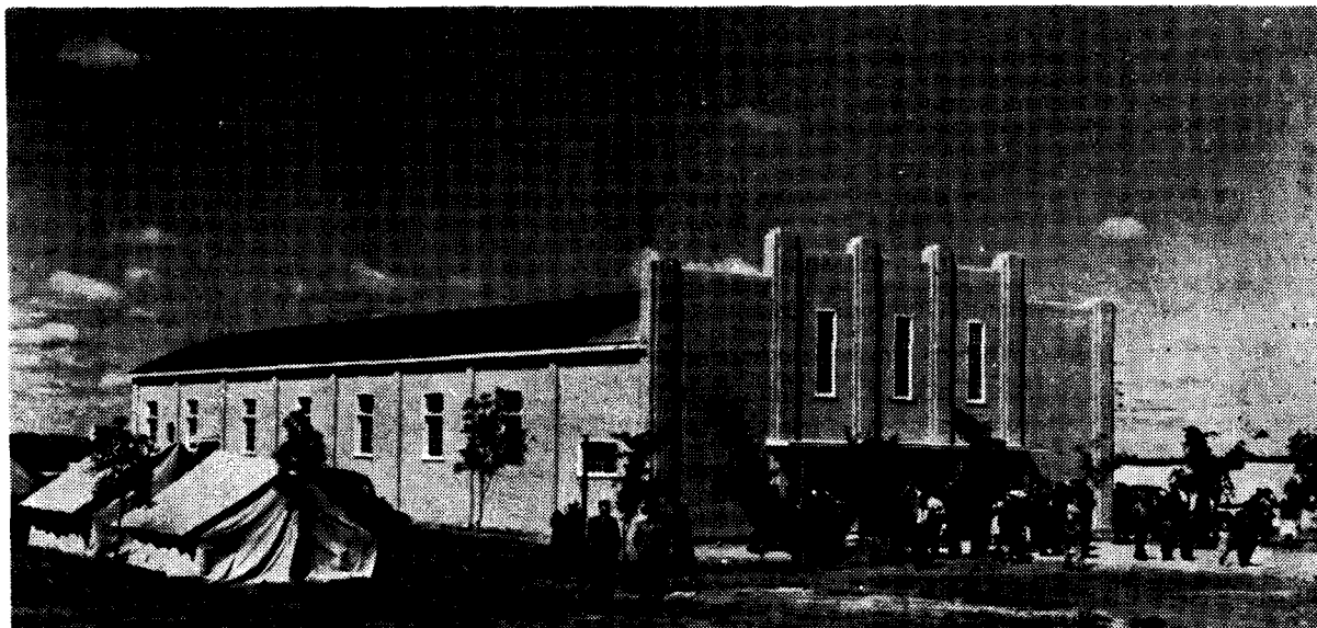
Camp Meeting Auditorium of the Manitoba-Saskatchewan Conference at Saskatoon

Note this earnest appeal by the Lord's servant— "Let all who possibly can attend these yearly gatherings. All should feel that God requires this of them. If they do not avail themselves of the privileges which He has provided that they may become strong in Him and in the power of His grace, they will grow weaker and weaker, and have less desire to consecrate all to God. Come, brethren and sisters, to these sacred convocation meetings to find Jesus. He will come up to the feast."— T2, p. 575.