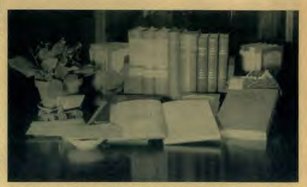
The camplete set of Prophetic Faith of Our Fathers, together with more than Fifteen other volumes was placed in the University Library, and also in the Central Public Library. The Librarians in each case were happy to receive the books featuring Seventh-day Adventist teachings.