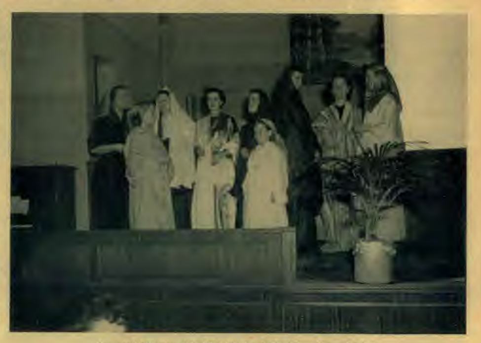
A pagent, "Warnen of the Bible," given by Saskatoan Darcos Society.

It is planned to present the pageant at other nearby towns at later dates.