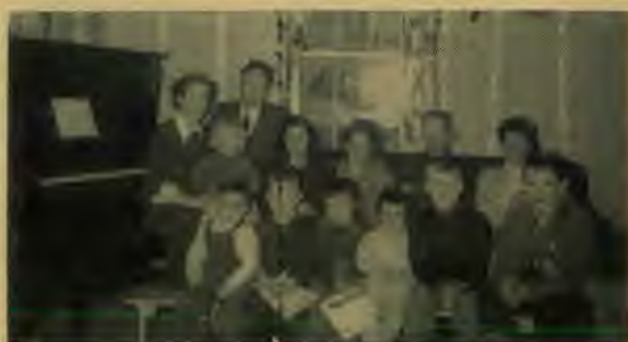
Successful Branch Sabbath School at Petitcodiac.