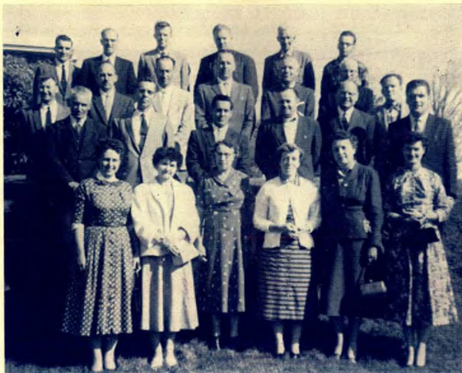
Special Literature Evangelism Training School for Eastern Canada.