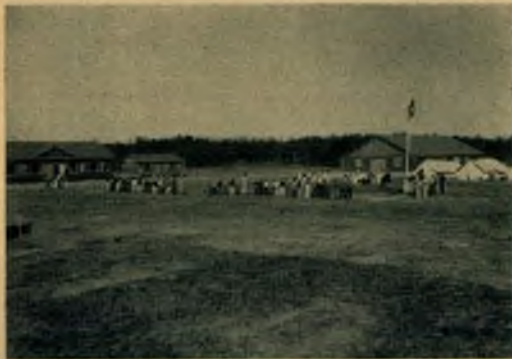
Clear Lake camp site—the place for Christian recreation.