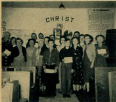
Tugaske Leadership Group.