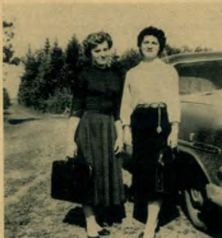
Typical Student Colporteurs.