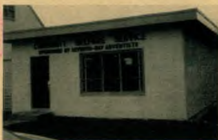
The new welfare building recently opened in Pentiction on the church property, corner of Fairview Road and Douglas Avenue. Built and financed by the Pentiction church members, this attractive building more adequately meets the needs of the expanding welfare programme carried on by our Dorcas Society in this city.