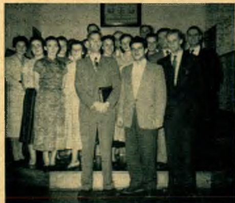
A Typical Voice of Youth Group—Winnipeg German Church.