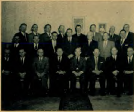
Historic meeting of leaders of Ukrainian work in Canada.