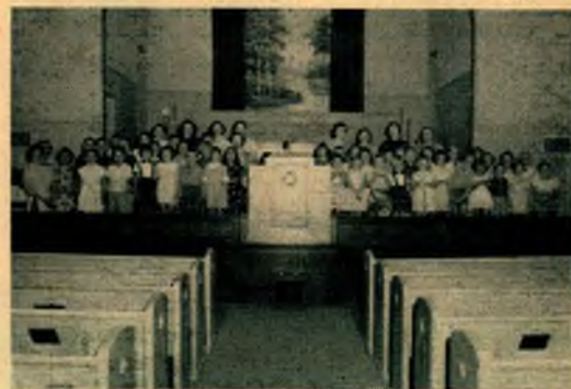
Sabbath School evangelism in action—a Vacation Bible School in Saskatoon.