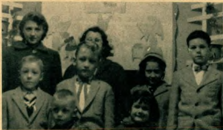
Children of the Charlottetown Sabbath School who raised one-third of the Investment offering.