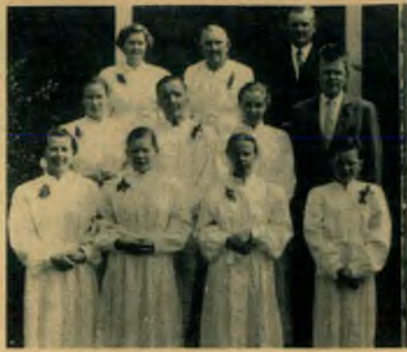
Finnish baptismal candidates at Lakehead.