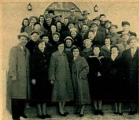
Colporteurs at work in Winnipeg learning to make their work more effective.