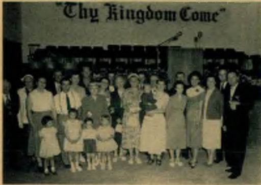
Voice of Prophecy converts at camp meeting.