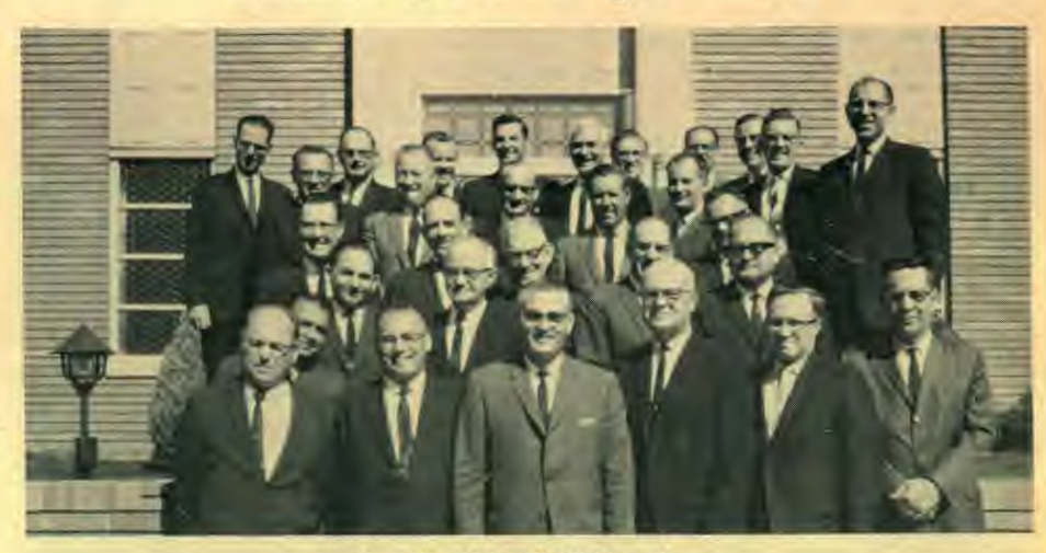
Canadian Union Publishing Group