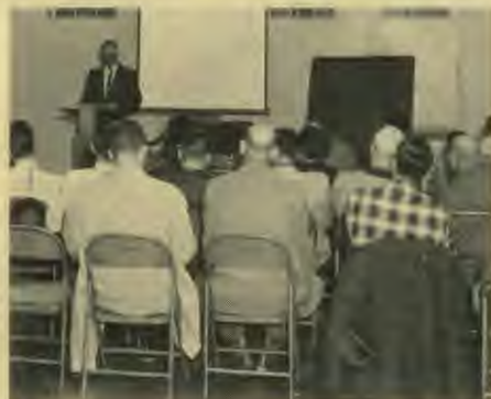
Part of the audience participating in the Five-day Programme in Lethbridge.