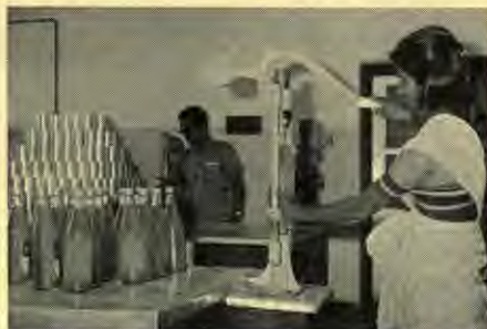
School is now bottling pineapple juice.