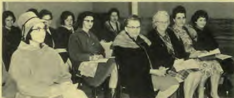
A portion of the group that came out each evening to learn better ways of nourishing their families.