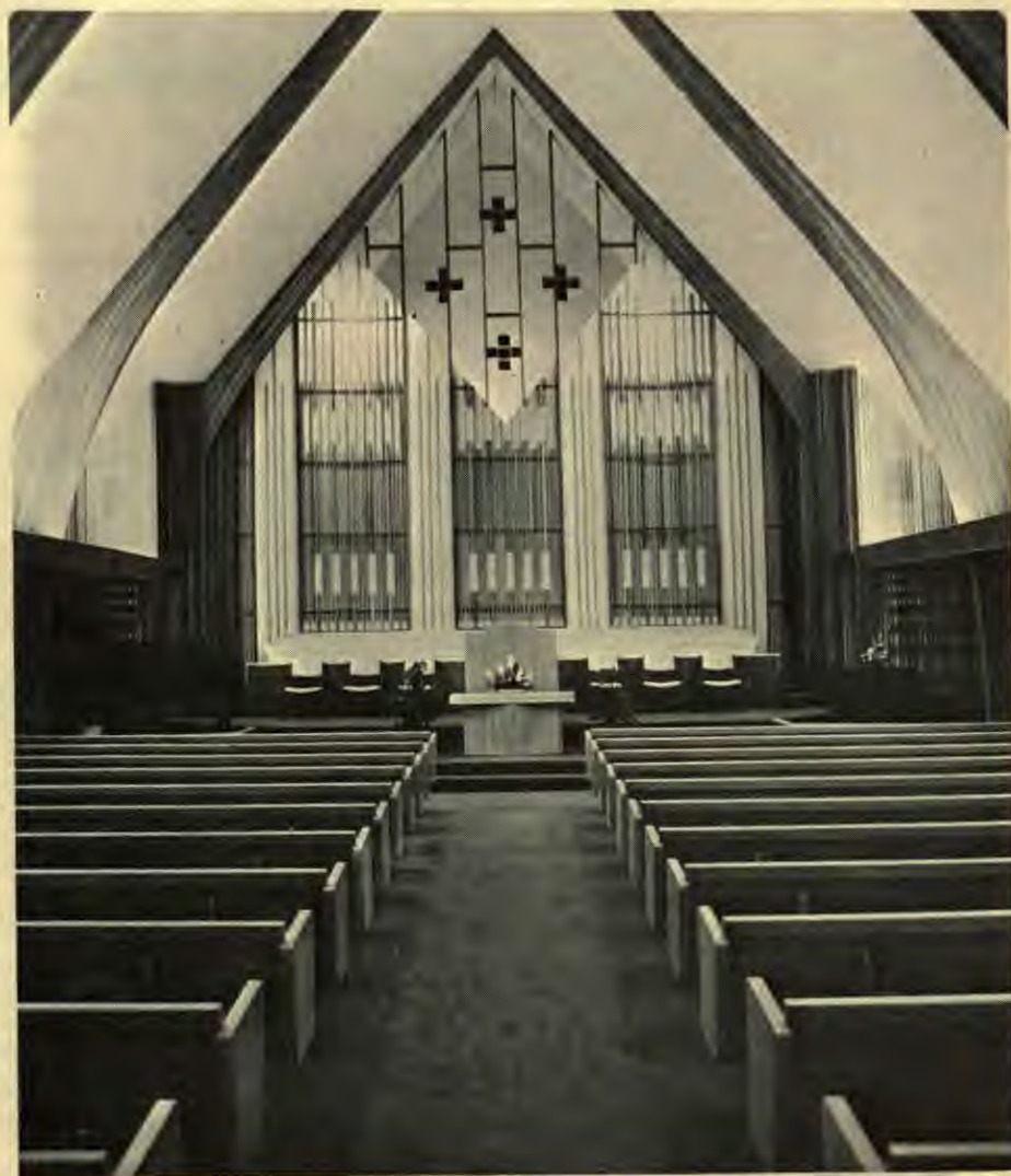
Interior view of the Westminster Church