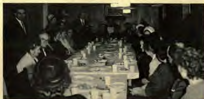
Fellowship supper held in the Ukrainian Church basement for all the Hungarian church members and others who attended the meetings.