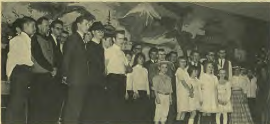
Participants in the CUC Amateur Hour.