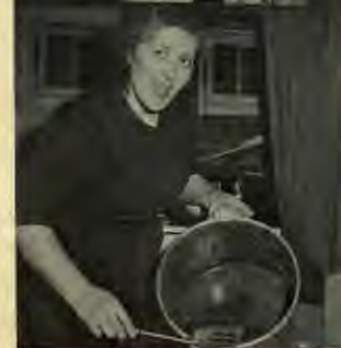
One of the cooks preparing refreshments for the Hungarian banquet held the last night of the evangelistic series.