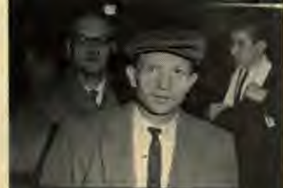
Other Hungarian visitors who attended the evangelistic meetings and are interested in learning more of the Bible truths.