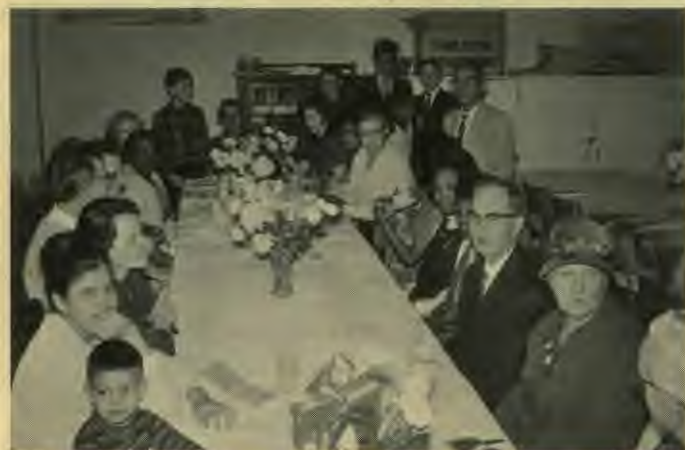
Members of the Toronto East Seventh-day Adventist Church gather around the victory table. The occasion was a happy one, for it marked the achievement of another year of successful Ingathering.