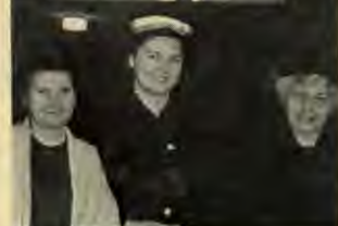
Extreme left — the oldest Hungarian believer in the newly-organized church group.