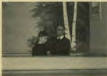
May the Lord continue to bless them as they walk the Christian pathway.