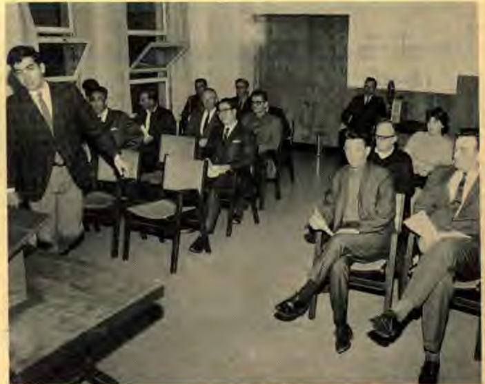
A partial group of those who attended the Five-day Smoking Plan held recently at the Y.M.C.A. in Moncton, N.B.