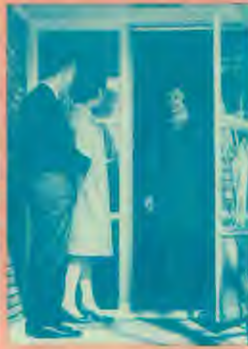
America's favorite hymns are featured on a coming Faith for Today telecast. Hymns carry their own message of Christ's love.