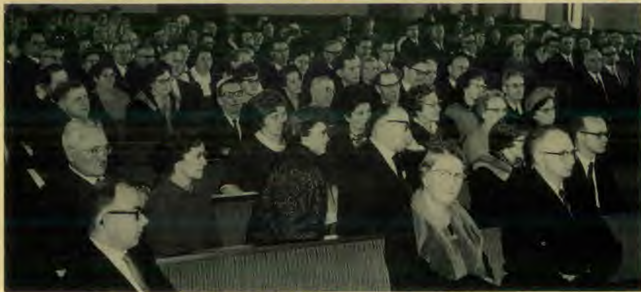
Some of the over-300 church officers attending the Conference-wide officers' planning meeting.