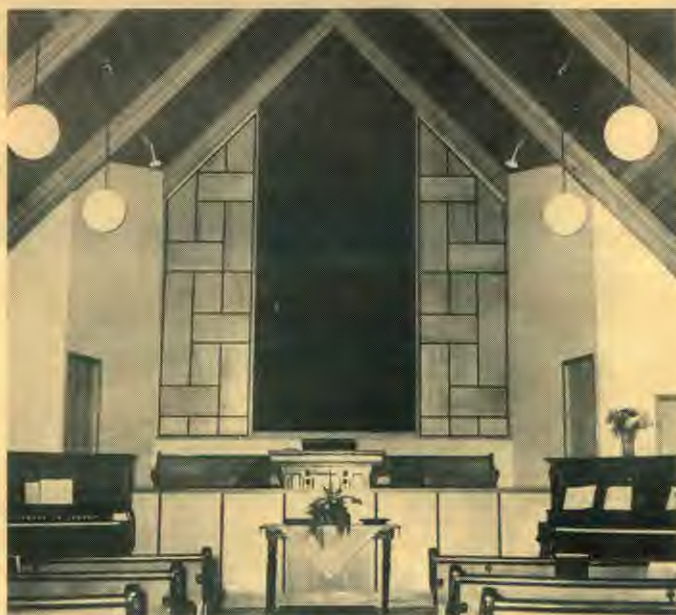
Interior of the beautiful Belleville Church that was dedicated May 3, 1969.