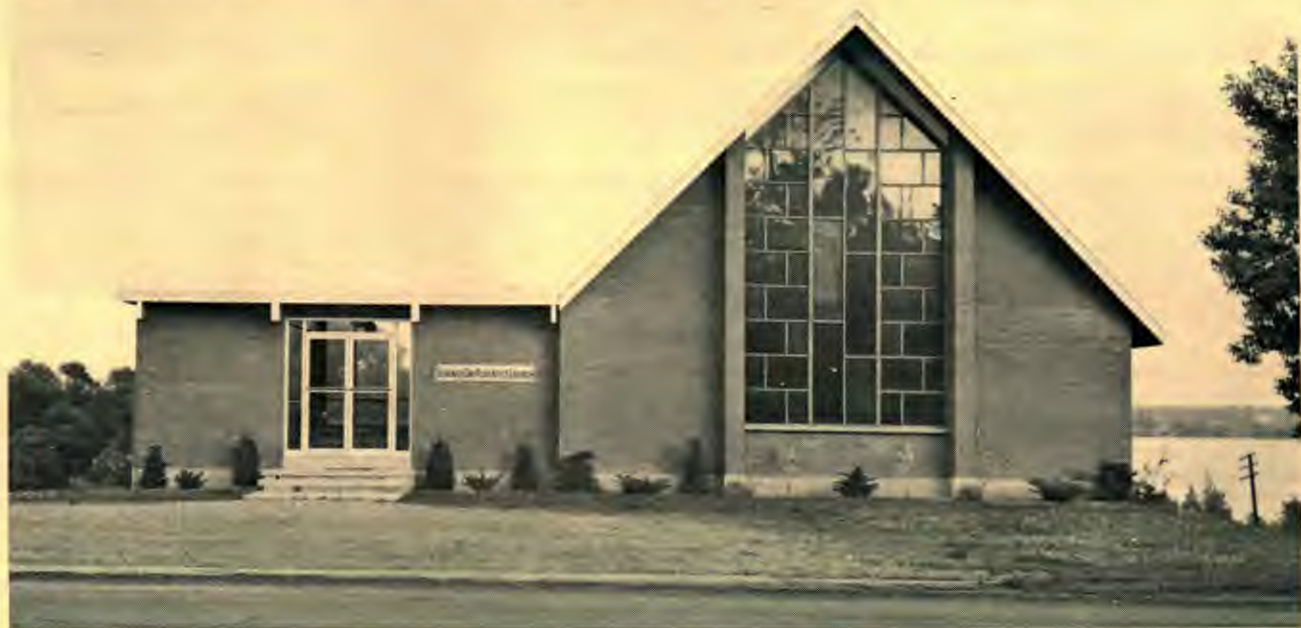
Debt free in three years—the Belleville Seventh-day Adventist Church, Dundas Street West, Belleville.

May God continue to bless the Belleville congregation as they go "forward in faith."