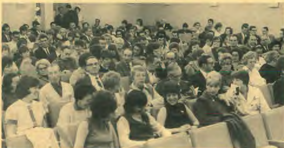
Partial view of audience in Branson Auditorium on opening night of Five-day Plan, April 13.

of her contact with the Five-day plan last September. Seeds of the gospel have been sown in many such hearts, which will likewise spring up and ripen in due season. Earnest prayer is solicited for these Plans, that struggling souls may be freed, and God's name glorified.