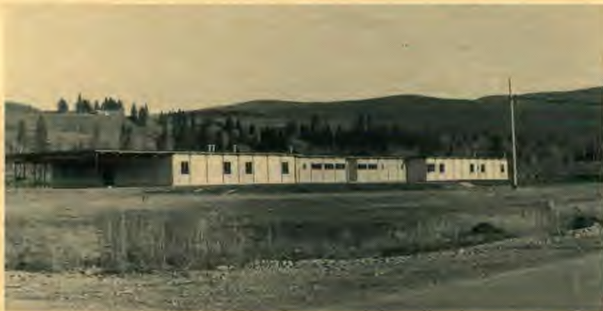
Front view of new Okanagan Academy.

population growth makes the construction and operation of this school possible. It is the prayer of those who have worked and sacrificed to make this school a reality that it will play an even greater role in Christian education and hastening the day of Christ's return.