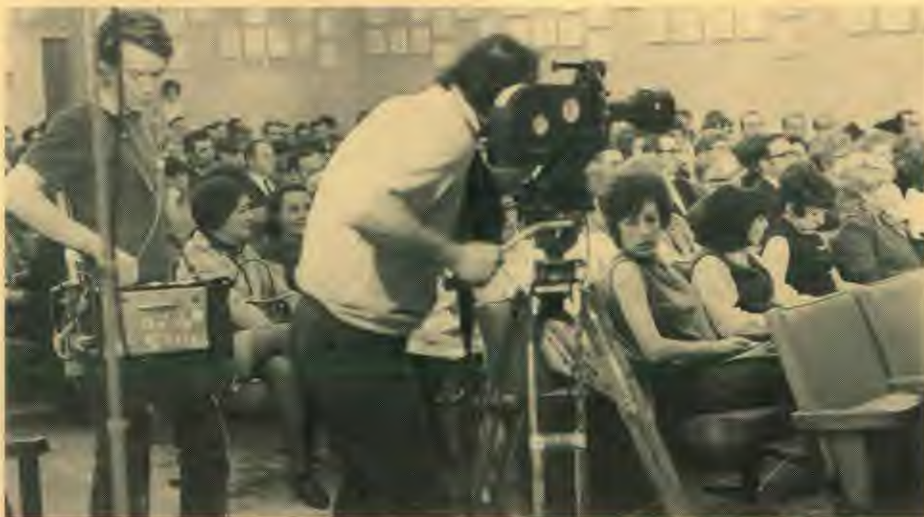
TV cameramen from Channel 9 (CTV) at work on opening night of Five-day Plan, Branson Auditorium, April 13.