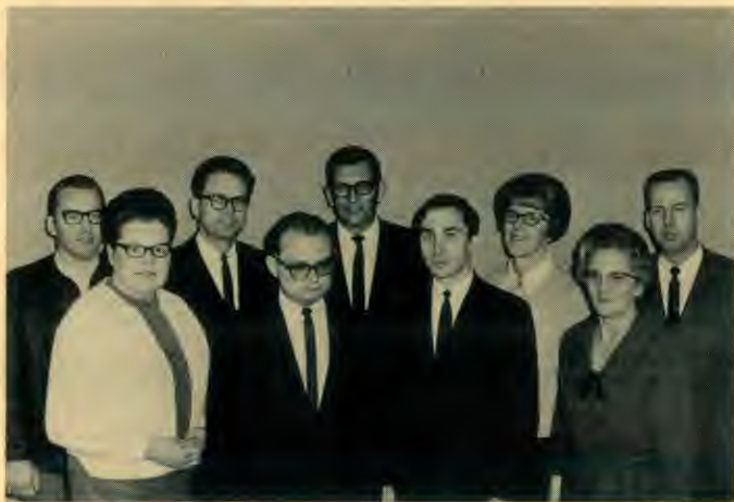
Full-time-teaching staff Okanagan Academy 1968-69.