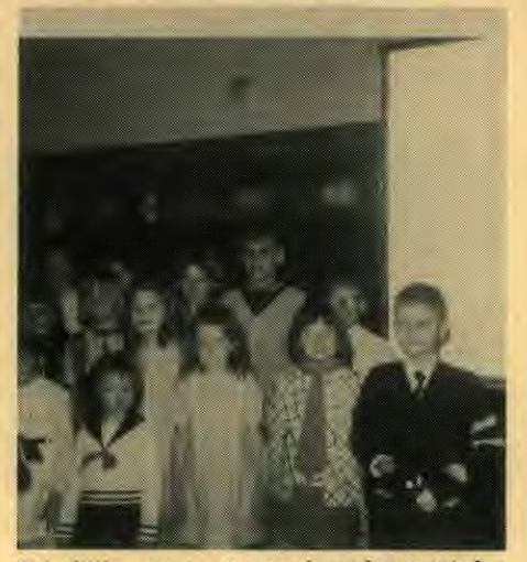
This little group sang carols and presented a very fine program to assist in raising funds for the new church school.