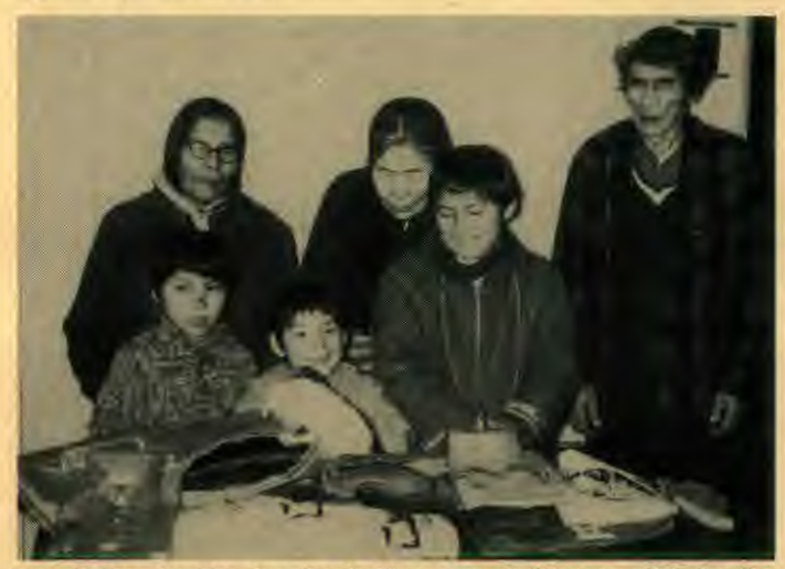
Two Indian families happily looking over clothing supplied by the Seventh-day Adventists in Yellowknife.