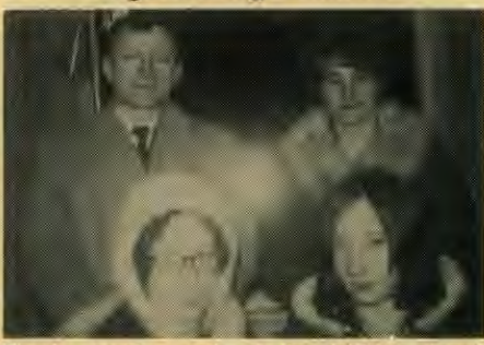
Thanks to the work of the faithful church members of the Bay Roberts Seventh-day Adventist Church in Newfoundland, the church was able to reach its Ingathering goal again this year. Those pictured above each gathered $50.00 and over.