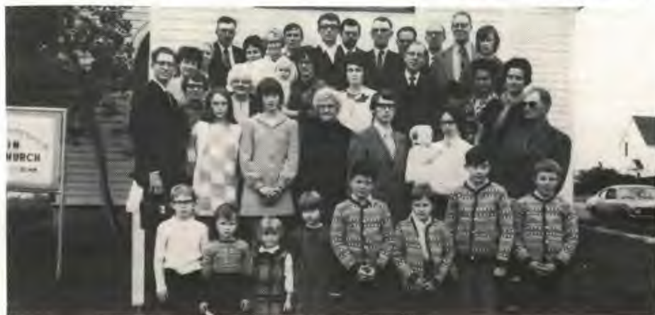
The Ryley Seventh-day Adventist Church group.