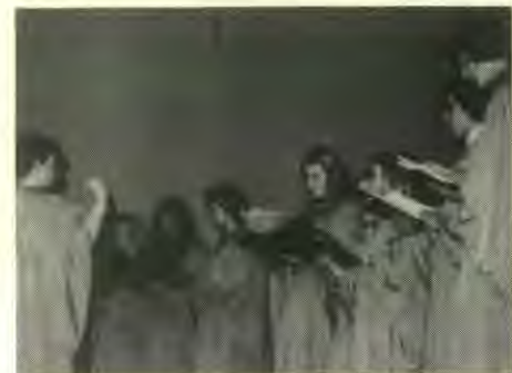
Members of the Moncton Youth choir.