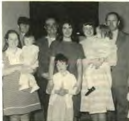
Parents and babies of the dedication.

their children to the Lord for this beautiful and meaningful service.