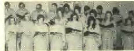
The Moncton Church choir.

Variety is the spice of life. Such was the case on February 10, 1974 as the Moncton Church Choir sponsored a variety program in the Moncton Lions Senior Citizens Center. The purpose of the program was to raise money toward the newly purchased choir gowns. The program consisted of several skits, a travelogue of England, and a sacred concert by the choir. The choir robes themselves have added a new dimension to the worship service at the Moncton Church. It is hoped that this choir may be able to serve in an effective way in presenting the gospel by song.