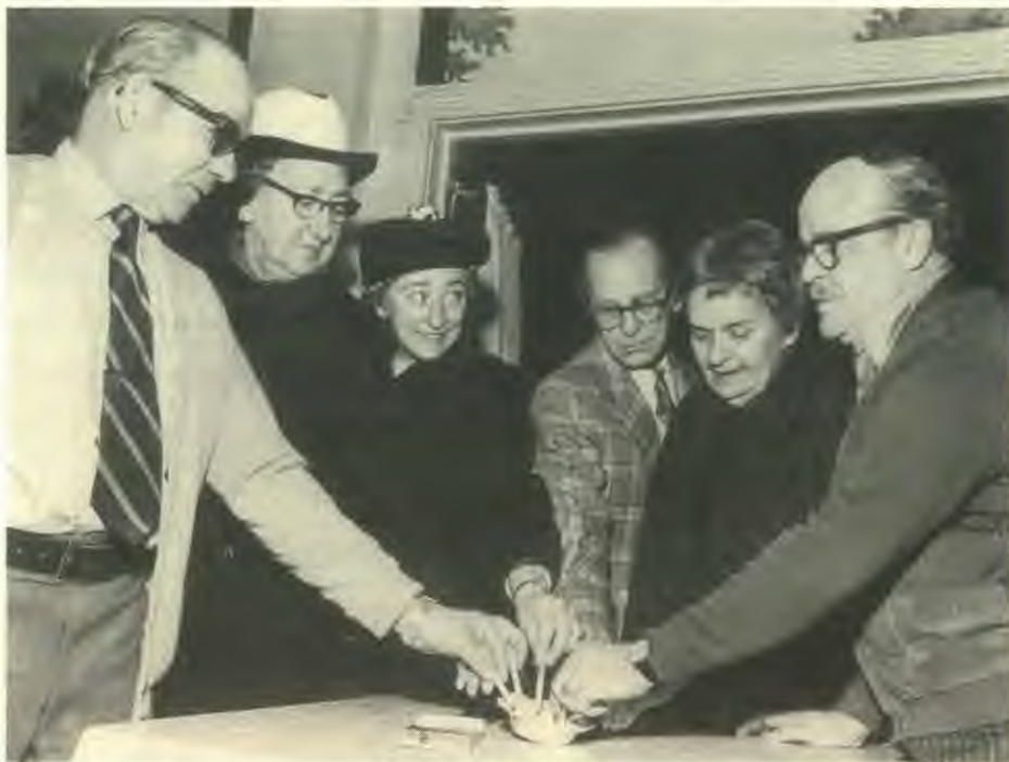
Their last puff — they hope.

From a survey taken of the participants, it was found that every single one had previously tried to stop smoking. Of those who attended consistently (for not less than 4 days), 83 1/3% succeeded in quitting. Many expressions of gratitude