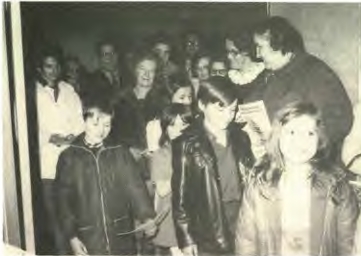
Ladies greeting some of the people in attendance at one of the Hopewell Hill evangelistic meetings.

all across Canada. They believe it will be the means of confronting the people of this area with the Three Angels' Messages in a more effective way and hasten our Lord's return.