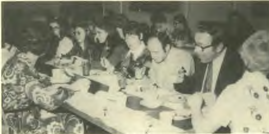
Some of those in attendance at the Ingathering Victory supper.