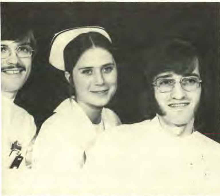
are the latest graduates of the Registered X-Ray Technicians Course.

course are Ontario grade twelve or equivalent with physics and science and reasonably good grades.