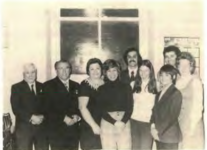
Nine souls, the first direct results of the Portuguese telecast, became members of the church on February 17.