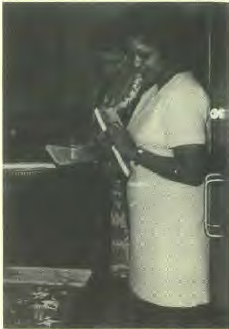
Division leaders in Storage Room.