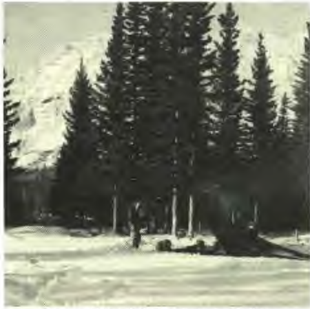
Kananaskis winter camping country.

Would you believe 28°F below zero? And living under open plastic and nylon shelters? This is winter camping at its best — or worst, depending on one's point of view.