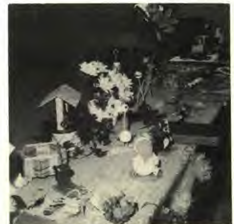
A portion of the arts and crafts display. Don't give up until you find "Casper the Cat."