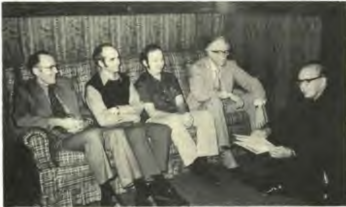
Officers elected for Ontario Alumni Chapter of AU.