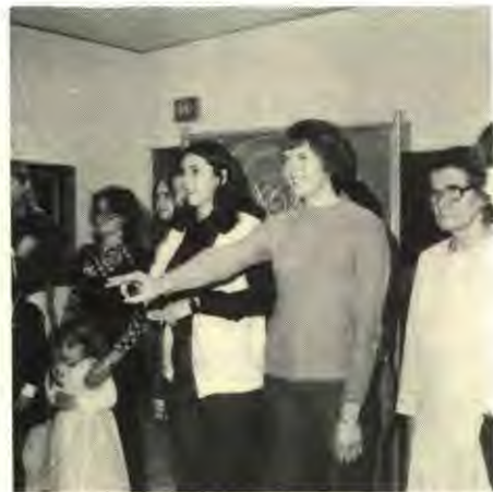
A number of MV/Pathfinder leaders participating in what must have been a game of concentration.