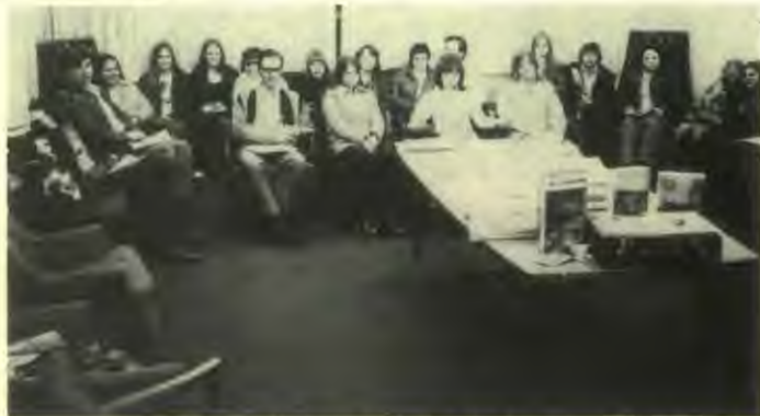
Canadian Union College Students attending the Literature Evangelist Institute at College Heights, Alberta.