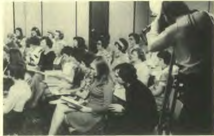
T.V. cameras brought highlights of the course to cross-Canada viewers on CBS "Up Canada Show" February 18, 10 p.m.