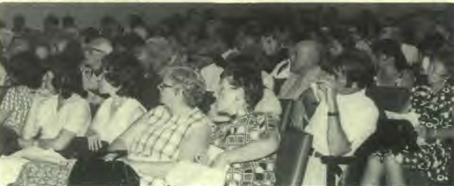
A good section of the audience attentive to lecture presentation in auditorium of Branson Hospital.

During 1974, the Dietary Department conducted various Community Nutritional Courses. The one in particular, which above any other, we would mention at this time, is that of Weight Reduction — which we named the "Branson Hospital Slimming Club". Since Obesity is labelled as Health Enemy No. 1, both in the U.S.A. and Canada, because it is the forerunner of other serious illnesses, the teaching project of dealing specifically with this health problem, would promote a means of practising "Preventive Medicine", for those in any community.