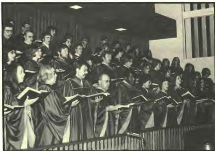
A section of the choir singing one of the carols at the Christmas vesper service.

Canadian Union College College Heights, Alberta T0C 0Z0