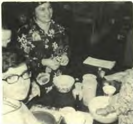
An experimental new feature of this Nutrition program was that following the lecture and demonstration, all who attended entered into making the item of food for themselves, and they enjoyed that very much, both the men as well as the ladies. This served to overcome the problem of getting folks to make their first try at some cookery which had not been familiar to them. The results were termed very successful.