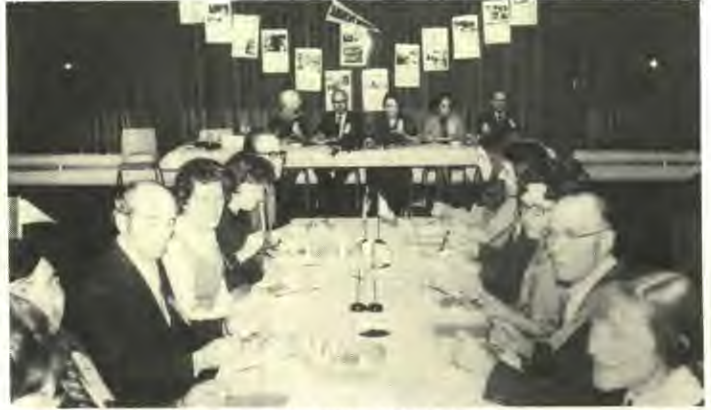
Some of the group at the banquet.