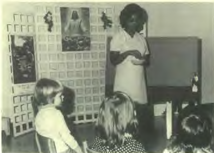
Cradle Roll Room.

The membership and attendance of the church is growing fast. The church will soon be filled. We praise God for His blessings.