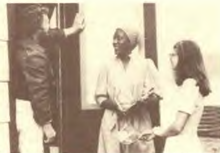
ACT team from C.U.C. making a survey of the town of Yellowknife.