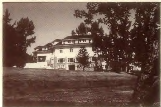
Conference Camp main building. The Conference Camp is 3 miles south across the lake from the Youth Camp.

SEE NEXT PAGE FOR LAYOUT AND MAP OF CAMPS