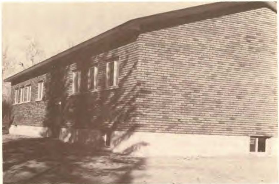
Front view of the new Thunder Bay church school.

There are twenty-eight students enrolled at the school in eight grades. Two teachers share the duties which include scrubbing washrooms, floors, and splitting wood for the furnace.