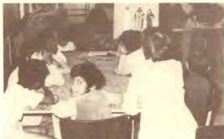
VBS in Yellowknife. Here are the children listening to the Bible story while others in the background are doing crafts.