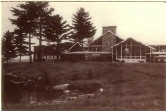
Youth Camp main pavilion (Partial view) with girls dorm to the left.

The capital cost to purchase both camps and to do the necessary development will require special contributions from the membership of $1,135,000 over the next three years. The response to date reveal that the Ontario membership believes that the vote of the constituency meeting truly revealed the will of God.