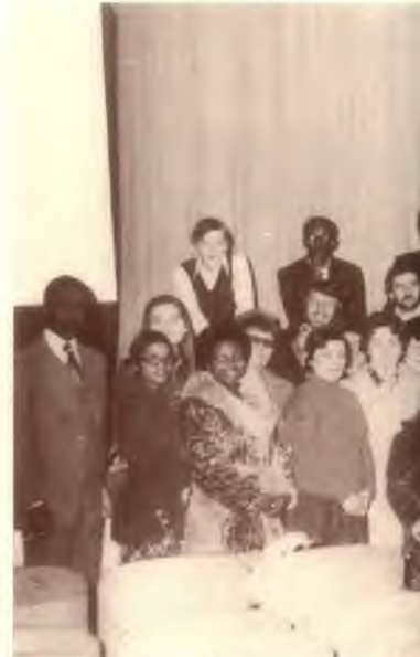
A large group came for