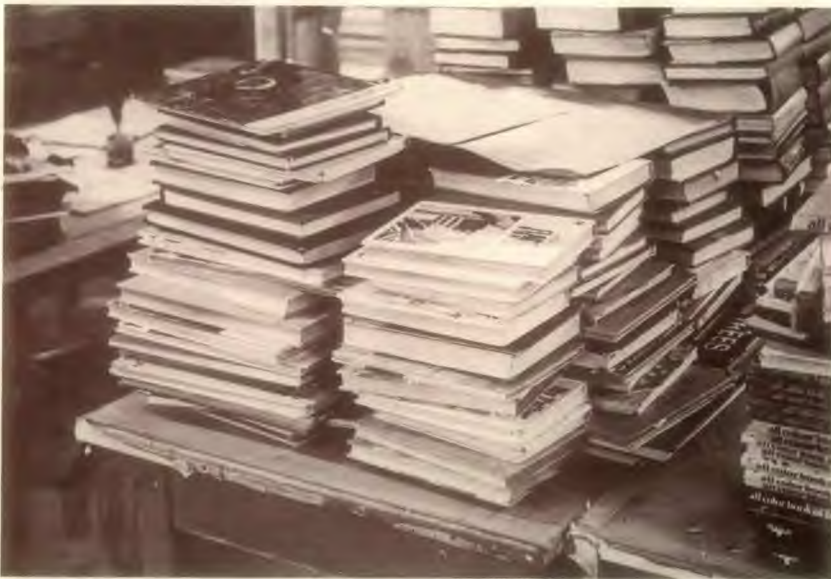
Books arriving for new spines, covers, and repairs.