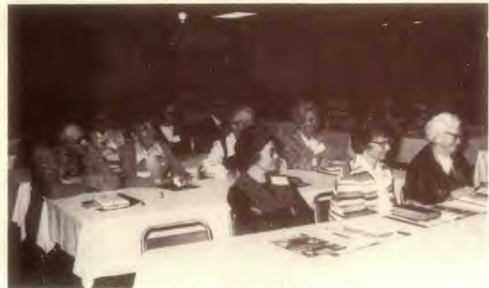
A portion of those in attendance.