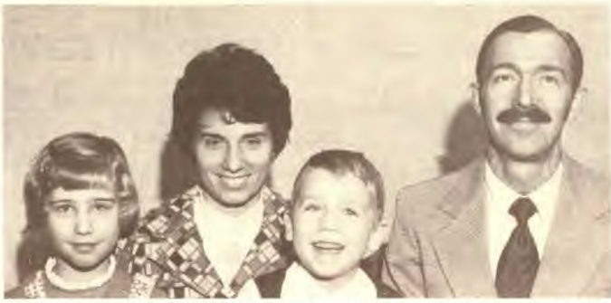
The Knoll family joins Ontario team — See write up on previous page.