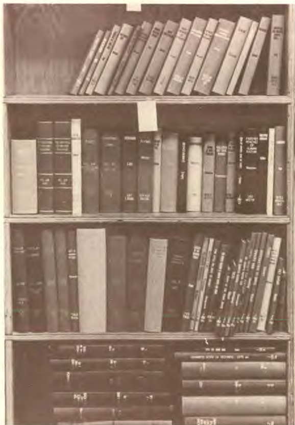
Finished product awaiting delivery to the customer.