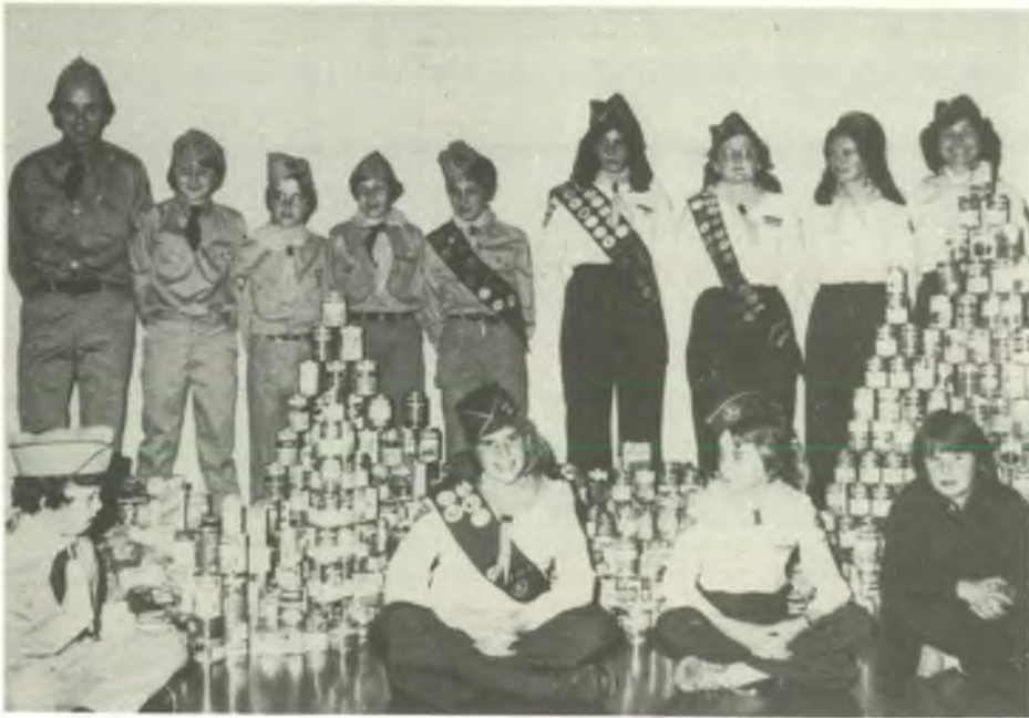
Edmonton Central Church Pathfinders.