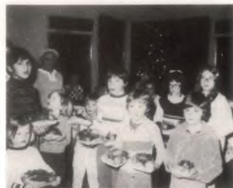
The Children from the Beauvallon church are ready to distribute fruit baskets to guests in Two Hills Eagle View Nursing Home following the musical program presented by the young people.

God has blessed Alberta with 250 souls as a result of personal and public evangelism. Thirteen crusades have already been planned besides laymen's training programs here in Alberta.