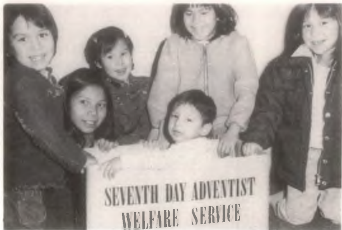
Happy Indian children, warmly clothed, thanks to the Community Services Centre.