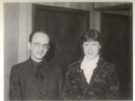
BAPTISM AT IRON BRIDGE