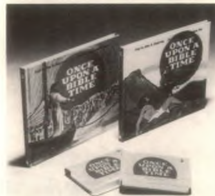
ONCE UPON A BIBLE TIME Book 1 & Cassette 1 Book 2 & Cassette 2

These books contain more Bible stories for children, worded just right for three- to seven-year olds. Authored by a recognized specialist in writing for little people, and colorfully illustrated to attract the youngest child's attention, they will be frequently leafed through by their young owners.