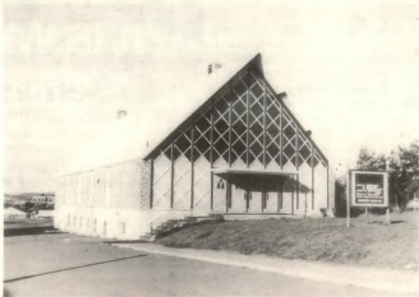
The Aldershot Street Seventh-day Adventist Church.

The Aldershot Street church was purchased from the Bethesda Pentecostal congregation, and is less than a block away from the Newfoundland Conference offices and St. John's Academy. The building is less than 20 years old, and is modern in design, bright, clean and well-maintained. The costs of heating, cleaning