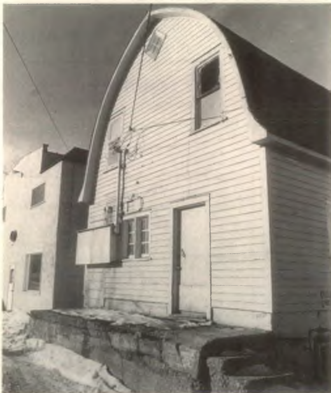
Flour building, demolished, 1978

Growth is often obvious—a new building going up, an old one being torn down, larger classes, new teachers, new programs. Sometimes growth is hidden—the library adding 250 books a month to its collection, a planning committee at work, teachers attending summer school or developing a new course, and a student sitting in a dorm room studying.