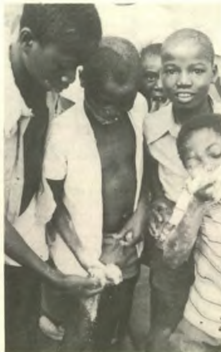
Children in Kolwezi, Zaire happily tasting the powdered milk donated by the Alberta Government.

Although the supplies had a wide distribution, covering many of the Provinces of this Central African nation, most of the flour, sugar, milk and oil was given in the Shaba and Kasai Provinces where the needs seemed to be the greatest. Some will recognize the name Shaba as being the scene of two invasions from neighboring Angola during the last two years. The forces were remnants of old