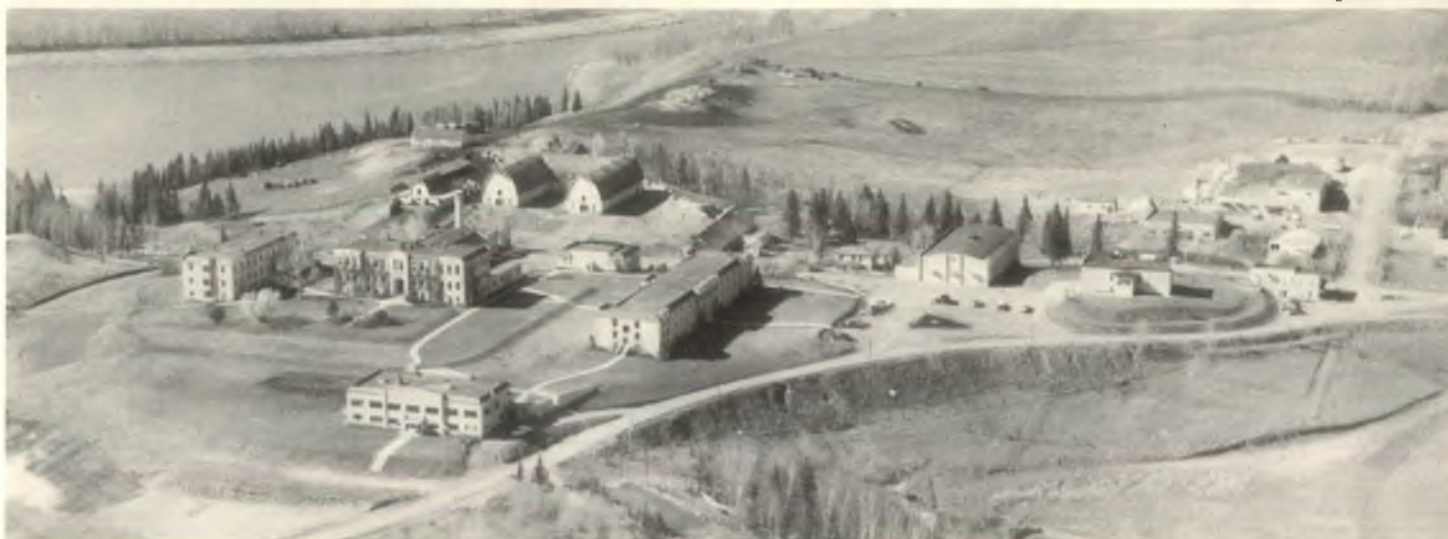
CUC Campus, 1958