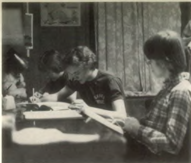
Student room, West Hall, 1978

Growth is often obvious—a new building going up, an old one being torn down, larger classes, new teachers, new programs. Sometimes growth is hidden—the library adding 250 books a month to its collection, a planning committee at work, teachers attending summer school or developing a new course, and a student sitting in a dorm room studying.