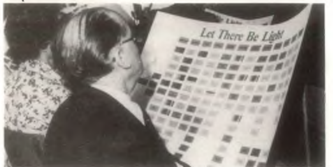
Studying ways in which various departments let their light shine.