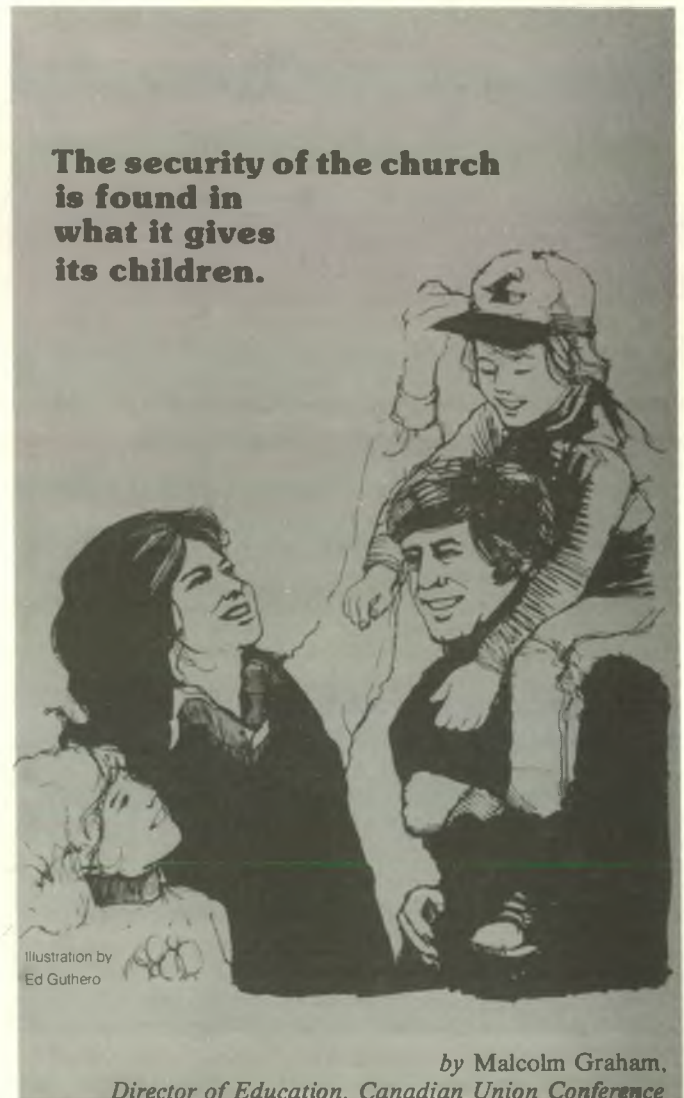
Illustration by Ed Guthero

The security of the church is found in what it gives its children.