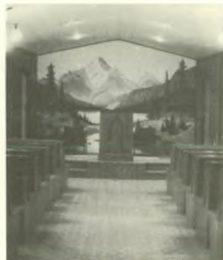
Interior of Nakusp Church.