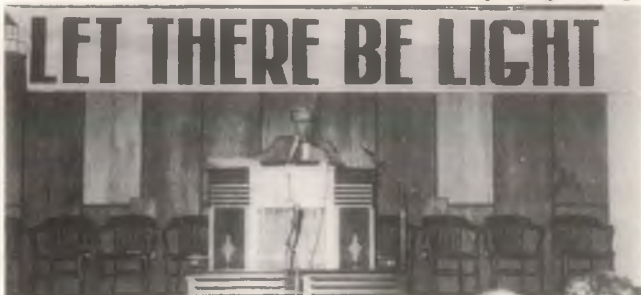
Watchword for the Seventh-day Adventist Church in Canada.

The Education Department is pleased to play a rewarding role in letting the light of the gospel shine forth from 83 "lighthouses" established from St. John's in the east, Terrace in the west, Windsor in the south, and Whitehorse in the north. Seventh-day Adventist schools are evangelistic centres where many decisions are made for Christ and for church membership. Many students and teachers are also active in witnessing activities which reach out into the community. May the light grow and not be dimmed.