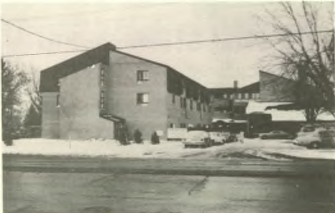
Kingsway Pioneer Home the day before Christmas. Many residents were already comfortably settled.