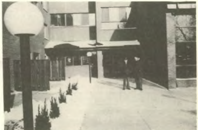
Two residents of Kingsway Pioneer Home in front of the main entrance.