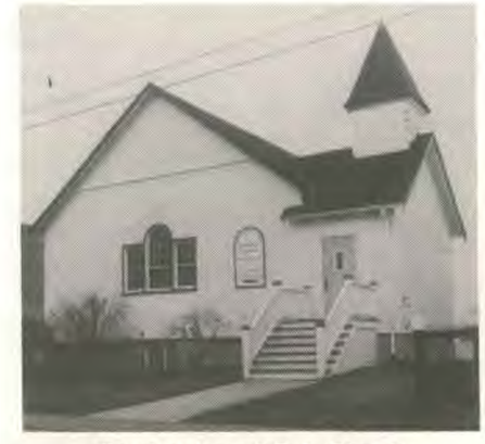
Charlottetown S.D.A. Church.

The first Sabbath School was organized on Sabbath afternoon, Oct. 26, 1935 under