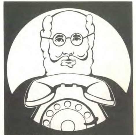
Finally the family decided to call Grandfather and ask his opinion.

Grandfather thought for a moment, then quietly answered.