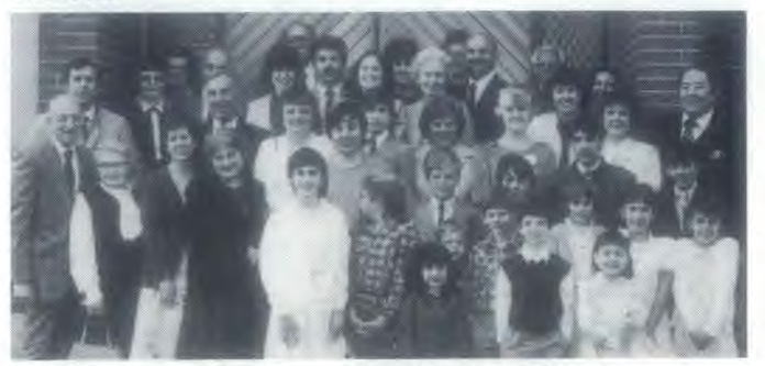
Lincoln Pioneer Seventh-day Adventist Church, Grassie, Ontario.

As this new church shines in its newness, due to the efforts of its members who had it renovated from the former Grassie Public School, we are sure to see it grow under the efforts of its dedicated members.