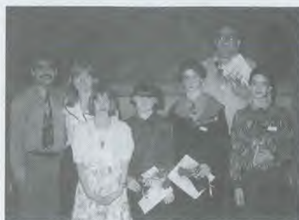
Another baptism took place February 25.

In addition to the main meeting in English, there was nightly translation into Spanish, in order to facilitate the growing Spanish group at