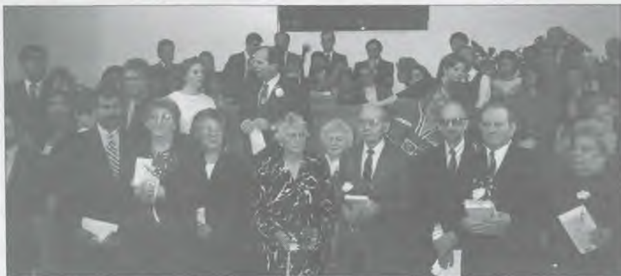
The fine group of baptismal candidates, certificates in hand, gathered at the rostrum of the Victoria SDA Church.

Months of planning and preparation by the Victoria Church evangelism committee, weekly prayer circles and the supportive church members at large, heightened everyone's anticipation for opening night. Who would come? Would 500 chairs be too many? Too few? Opening night attendance did match the church family's faith. Every seat was occupied. Several nights, double sessions were held to accommodate the crowds. Attendance was constant throughout the series, even with the transition of the meetings to the Adventist church several blocks away and significantly, when invited to a vegetarian fellowship luncheon at the Island Pacific Church School ten miles distant from the meeting hall, along with church members who provided the meal, some five hundred were fed. Throughout the latter part of the crusade, decisions to follow the Lord and keep His commandments were being made. During the final week, twenty-two baptisms took place with five more added on the closing Sabbath of February 18...real cause for joy in the Victoria Church family!