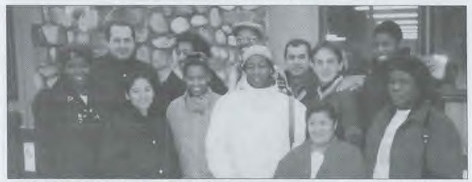
Twelve Pathfinder leaders pose at Michigan's Camp au Sable while attending the first convention for camp professionals. Attending Vision 2000 in Los Angeles is the focus of eight Master Guides this month. This meeting highlights the Pathfinder Ministry as it relates to the end of the 20th century.