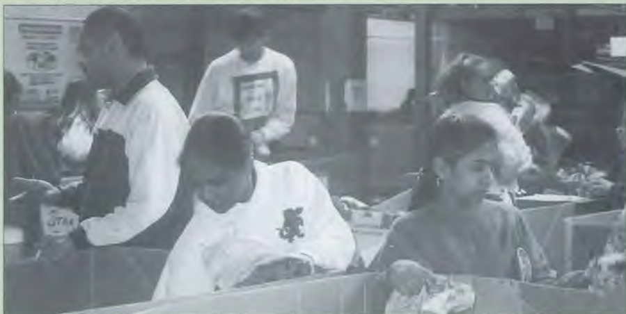
Kingsway volunteers sort clothing for Jamaica.