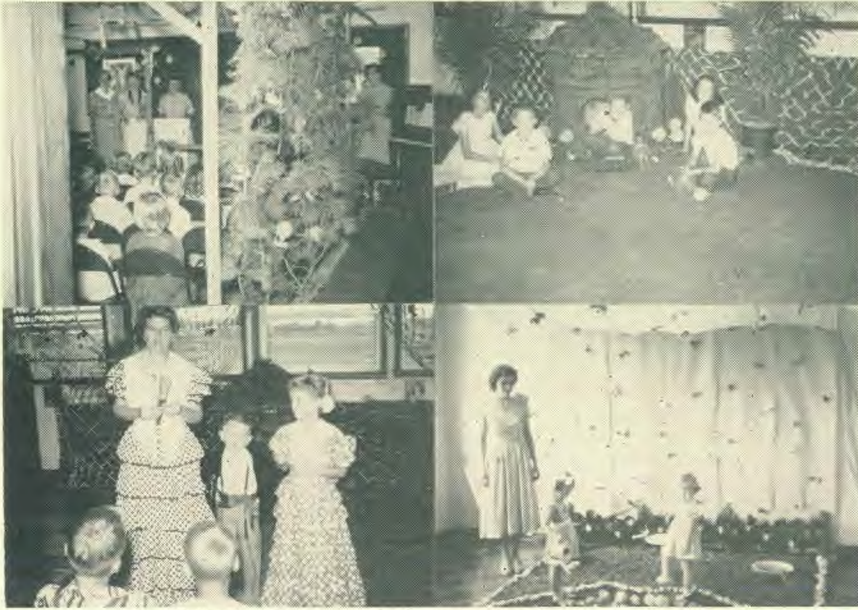
The children's divisions received outstanding help at camp meeting.