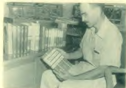
Librarian looking at one of the books.