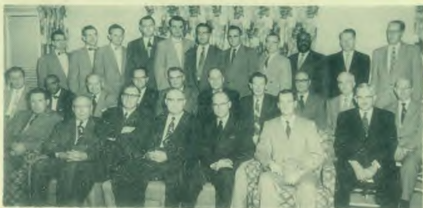
These are the leaders who attended the annual Central Union Publishing Council at the Union office, November 7 to 9. Large gains in colporteur sales were reported. Plans were shaped which will make it possible to add new literature evangelists to the ranks.

Yes, brethren and sisters, of immense interest to Seventh-day Adventists kingdom bound are the weekly issues of the Review and Herald . And of special inter-