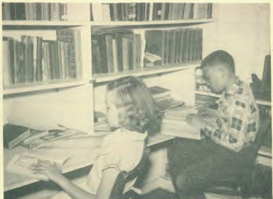
Two students of the Sunnydale elementary school find the library interesting.