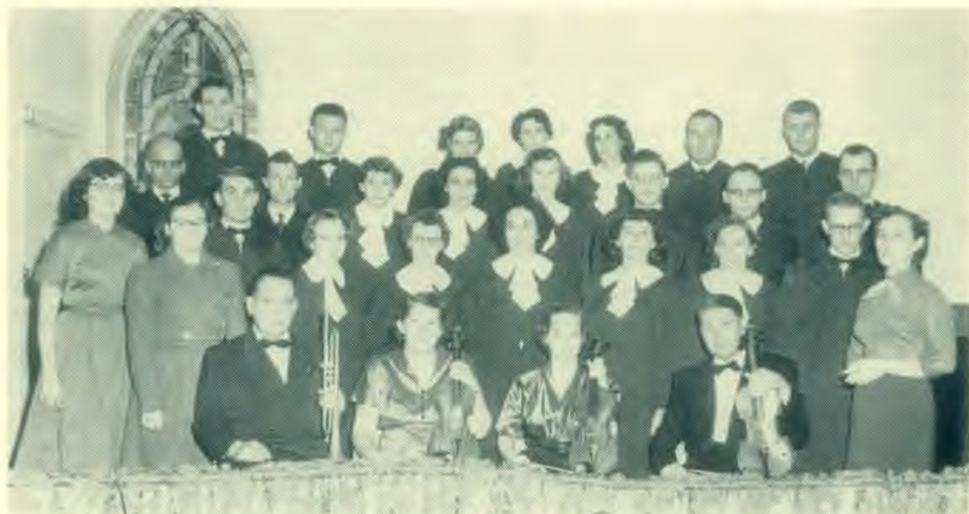
The senior choir and instrumental ensemble of the Lincoln City church.