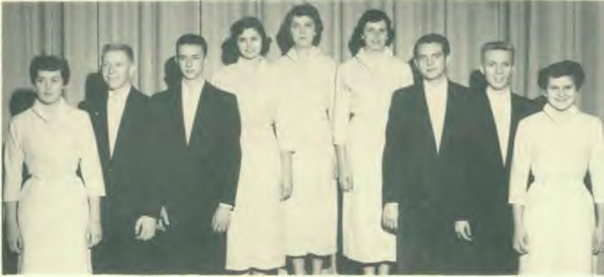
Orchestra of Platte Valley Academy