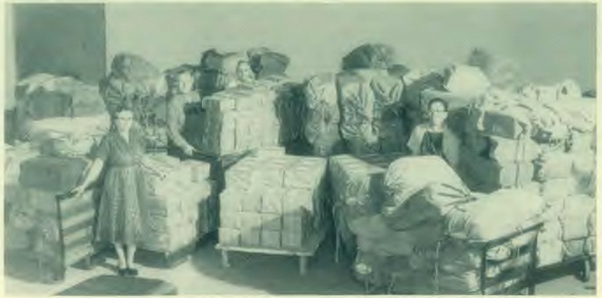
Pictured is the mail for one day leaving the Pacific Press.

As our Ingathering forces are moving out, let us join in united prayer that