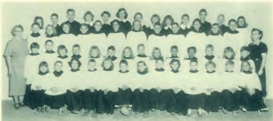
Junior choir of the Lincoln City church.

All living in and near the Lincoln and Omaha areas are cordially invited to attend this special program.