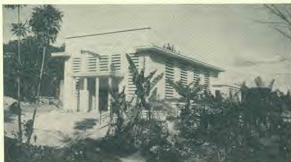
THE OVERFLOW Builds New Churches.

"If you are unwilling to sacrifice that you may save means for the work that is to be done, there will be no room for you in the kingdom of God."—Testimonies, vol. 9, p. 103.