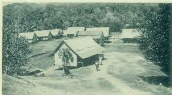
THE OVERFLOW Establishes New Missions.