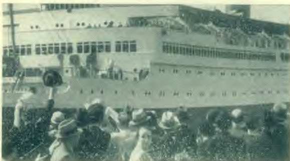
THE OVERFLOW Sends Forth Gospel Ministers.