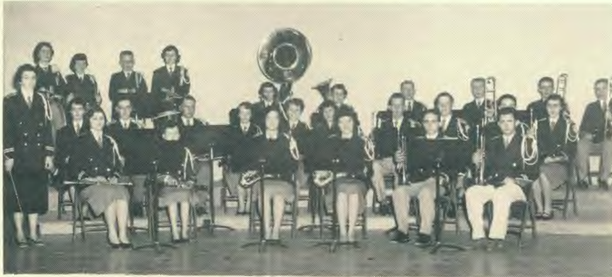
Platte Valley Academy Keynotes

holidays should not be passed by unnoticed. Although we are not in harmony with the worldly revelry that occurs during the holiday season, we do believe that on these occasions something special should be provided for the youth.