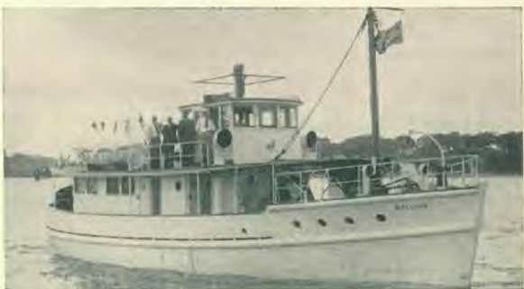
THE OVERFLOW Provides Mission Launches.

THE 13th SABBATH OFFERING DECEMBER 25, 1954