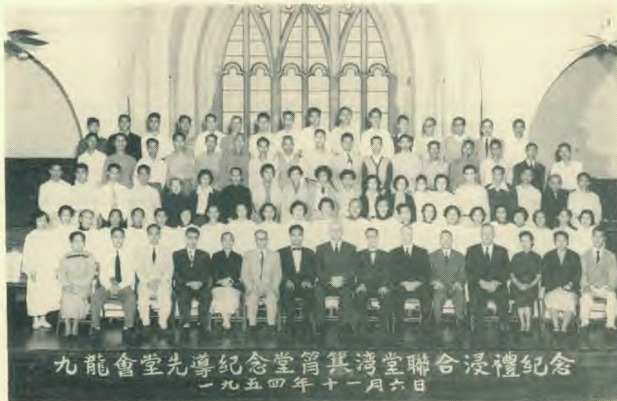
These individuals were baptized in Hongkong, on November 6, 1954.

We hope that every church in the North American Division will elect a