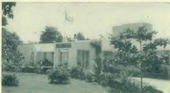
THE OVERFLOW Provides Needed Hospitals.