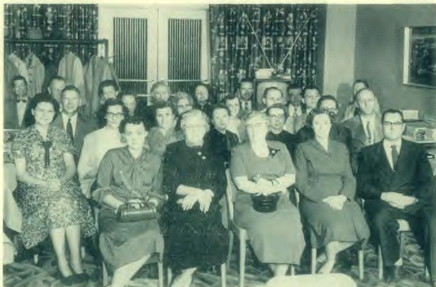
Missouri teachers in attendance at the annual teacher's institute.

Missouri Book and Bible House P. O. Box 556, Kansas City, Missouri