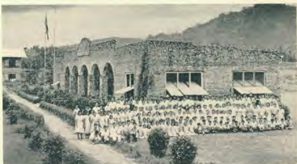
THE OVERFLOW Establishes Schools.