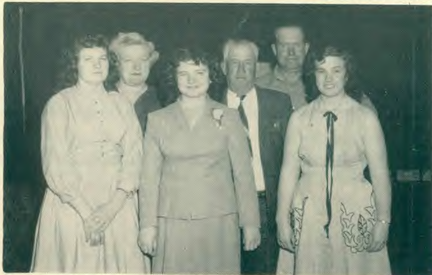
The Clapp family recently baptized.