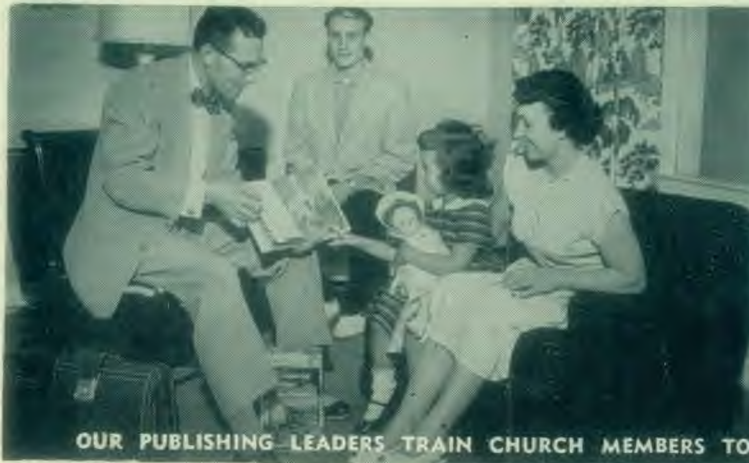
OUR PUBLISHING LEADERS TRAIN CHURCH MEMBERS TO SUCCEED. SO, WHY DON'T YOU TRY IT?