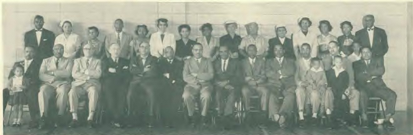
The workers and families as they attend the Central States Workers' Meeting.