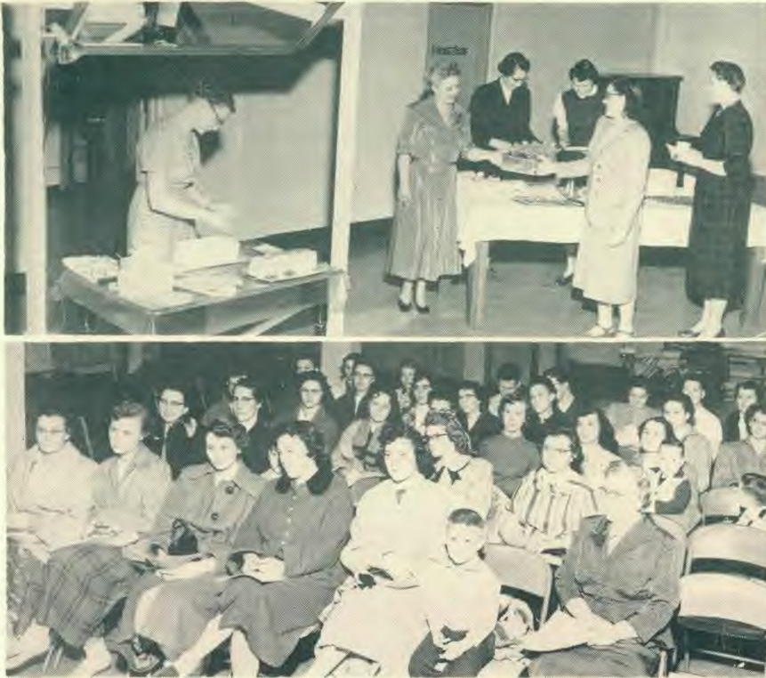
Top picture shows the cooking school in action. Bottom picture shows the group in attendance

healthful living should be made to the people of this area in co-operation with our Health and Welfare Center. YOUR RADIO DOCTOR, we believe, will fulfill this desire and gain many friends for the cause of God.