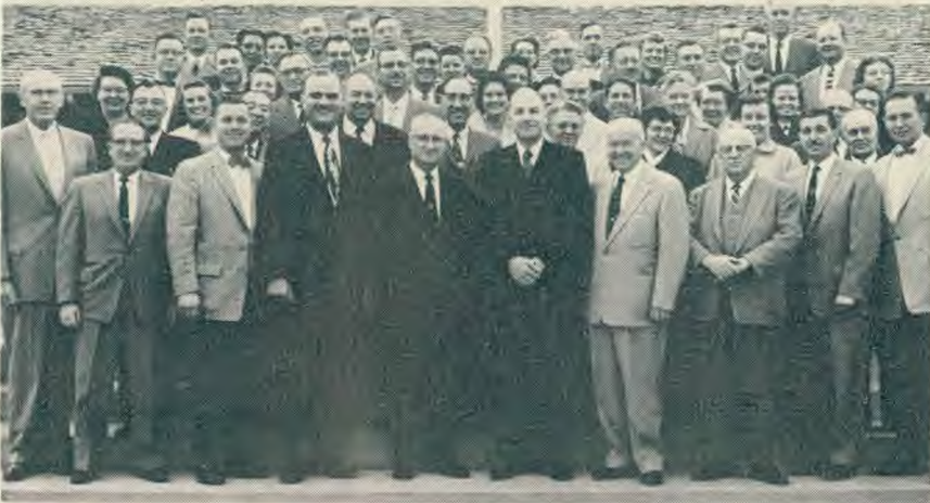
The Colorado Workers attended the Workers' Meeting and dedication of the new office building.

mission offerings have increased by $580.23.