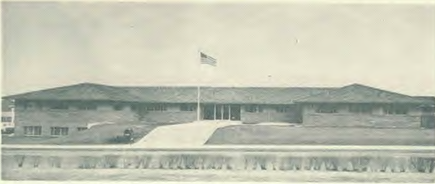
The new Colorado Conference office building was recently dedicated for service to God in these last days of earth's history.