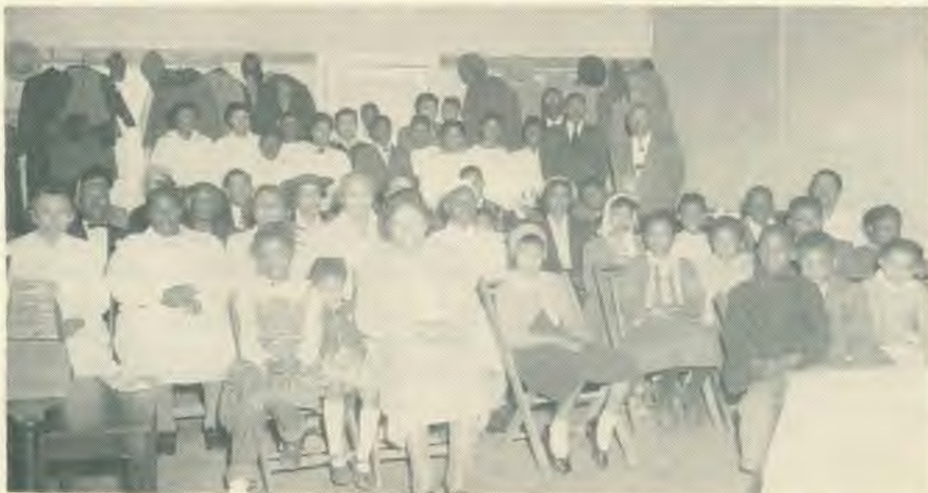
These members of the recently organized church of Kinloch, Missouri, are working hard on their building fund. They feel that a new church home is imperative as they plan to enlarge their membership. The Central States Conference officers welcome this group into the circle of churches.