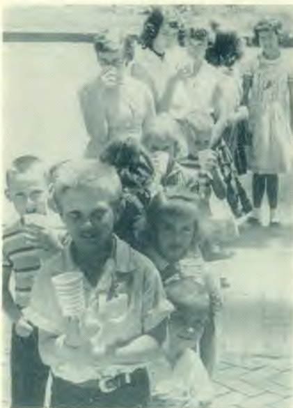
Here are shown a group of junior VSB children as they line up for morning refreshment. Plan now for your Vacation Bible School for 1958.

✓ The title shows an increase of $8,378.78 for the first two months and