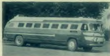
Platte Valley Academy Bus.

people will be able to arrive at the churches in a better physical condition. Our old bus was very inadequate in cold weather.