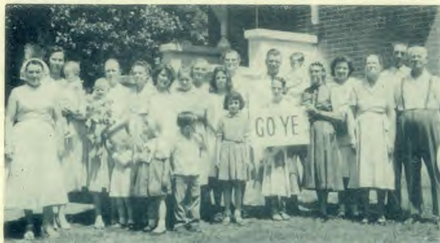
As the result of the combined efforts of the church members with the pastor, sixteen of the group pictured were baptized.

"We have no time to lose. The end is near."—Vol. 6, p. 22.