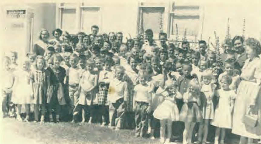
The Rulison-Rifle church had a successful VBS this year.

plans to carry on a follow-up program. We hold a V.B.S. Story Hour each Sabbath afternoon in the church. We use "Adventures In The Bible" films. So far we have had a good attendance. The confidence of parents is established in us by doing something for their children. Prejudice is broken down and the gospel seed is planted in the minds of boys and girls.