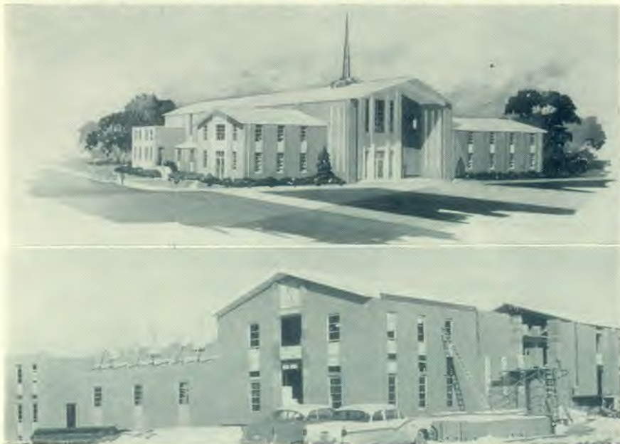
Top: Architect's drawing of the new South Denver church. Lower: The actual church in the process of construction. The first part of June is the proposed time for completion.

A general description of the church when finished is probably in order at this time. Multi-colored bricks are being used for the exterior, the predominating color being a warm rose. A very light beige trim of terra cotta is being used for the columns at the entrance ways and between the windows which will add a pleasing contrast to the over-all appearance. The windows will be of beautiful amber-colored glass