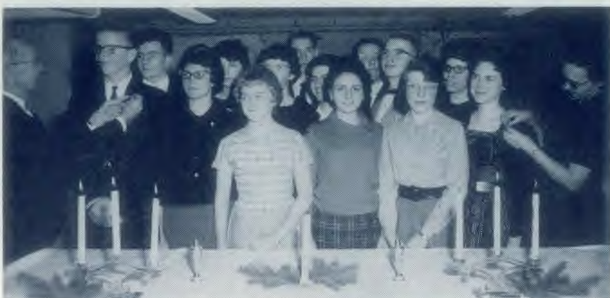
Fifteen Campion Academy students who received "Tell Ten" pins.