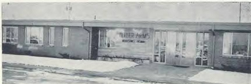
Teller Arms Nursing Home, Grand Junction, Colorado. Entrance to the main lobby is seen.

lobby is the very spacious and colorful dining room. Bright pastel colors dominate the decorating and furnishings throughout the entire building.