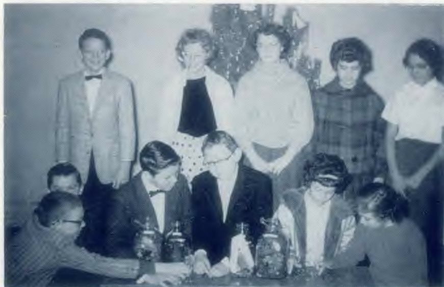
Junior division of the Piedmont Park church is shown with the pennies turned in for investment.