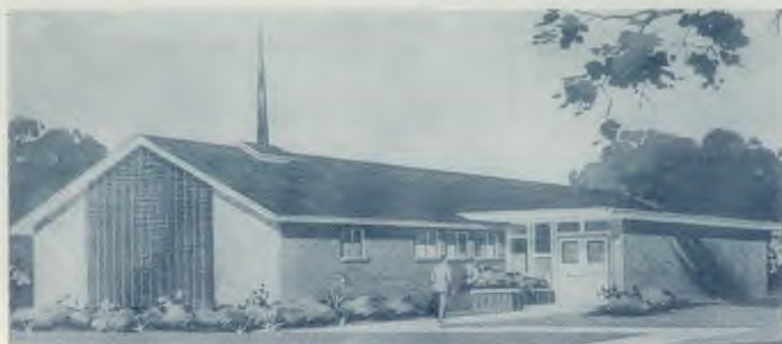
This is an architect's drawing of the new church for the Spanish speaking people.

five cents for each additional book if ordered to the same address.