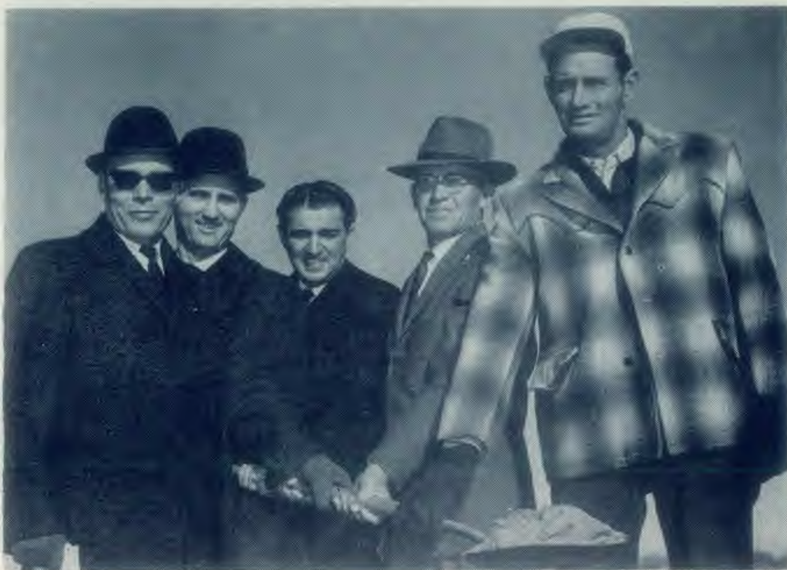
Ground Breaking at Alamosa

In addition to the teaching staff and the enrollment of our schools in grades 1 to 10, we now have a second twelve-grade school in the conference. Mile High Academy, formerly Denver Junior Academy, has been organized to handle 12 grades this year for the first time and has approximately 100 young people enrolled in grades 9 to 12. Our regular conference boarding academy at Campion has an approximate enrollment of 320 this current school year. The combined