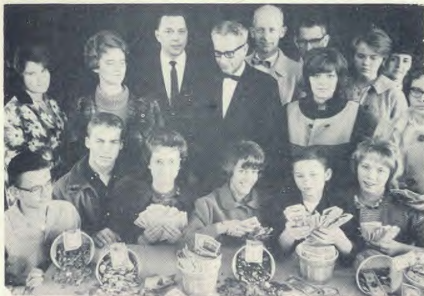
Students from Campion Academy were thrilled with the Ingathering funds received as the results of the two nights of caroling.

tive drivers, and appreciative teachers, all heavily dressed for the cold and snow, came back to the campus telling of interesting contacts, dog bites, cold feet, that ten-dollar bill given, the sick visited, and the joys of actual participation in the work of God.