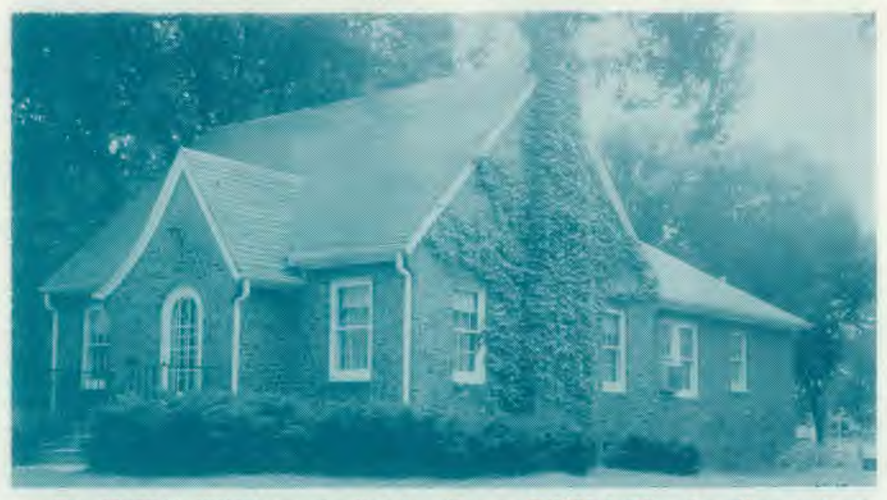
The CENTRAL UNION was the first to utilize an ENTIRE building for offices and personnel of the CENTRAL CREDIT ASSOCIATION. Ample room is provided in this spacious building for efficient work and expansion of the new Home Health Education Service Program. It is located at Calvert and 46th Streets, Lincoln, Nebrasko.

tion, so has our literature. Early books and pamphlets had pages crowded with small, hard-to-read type. We now say, without fear of contradiction, that Seventh-day Adventists now produce the most beautiful, and durable literature available today. Take, for example, the beautiful new subscription edition of Desire of Ages, that will be available this fall. Its more than 60 full-page, four-color illustrations, have been painted to the exacting specifications of denominational art directors, by the finest artists available. More than a dozen have been