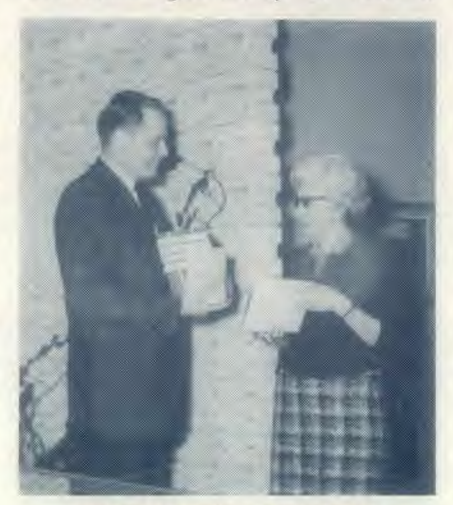
BOOKS GIVEN TO LIBRARY

I listen to your program every night on the THE BIBLE SPEAKS. It's the last thing I hear before going to bed at night. I've even tried to persuade my eight-year-old son to listen. But he asks so many questions of which I have no answers, I'm rather embarrassed. Would you have any way I could obtain a Bible from which I could study and then in turn be able to answer the numerous questions brought up by my children. I am of the Lutheran faith. Some years back about '58 and '59 I enrolled for the Bible studies put out by the Voice of